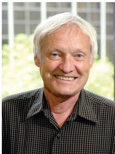
Joachim Frank (Born in 1940, Siegen, Germany) Columbia University, New York, NY, USA