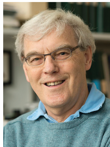
Richard Henderson (Born in 1945, Edinburgh, Scotland) MRC Laboratory of Molecular Biology, Cam- bridge, United Kingdom

The Nobel Prize in Chemistry 2017 was awarded to Jacques Dubochet, Joachim Frank and Richard Henderson “for developing cryo-electron microscopy for the high-resolution structure determination of biomolecules in solution”.