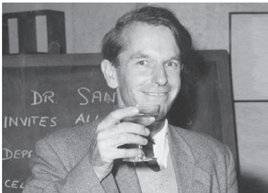
Frederick Sanger at his Nobel Prize celebration (1958) [23]