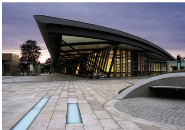
The Wellcome Trust Sanger Institute [32]

Frederick Sanger has been recognized with numerous awards and honors, including Corday-Morgan Medal and Prize, Chemical Society (1951); Fellow of King’s College, Cambridge Fellow of the Royal Society (1954), Foreign Honorary Member of the American Academy of Arts and Sciences (1958); Nobel Prize in Chemistry (1958); Honorary Member of the American Society of Biological Chemists (1961); Member of the Academy of Sciences of Ar-