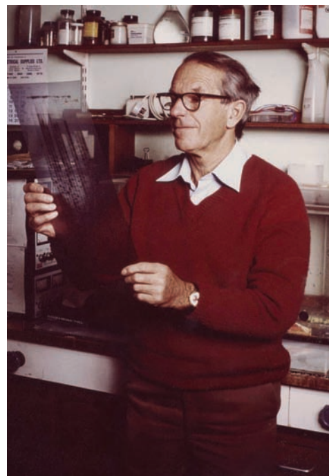
Frederick Sanger – the father of genomics looking at an autoradiogram of DNA sequence. MRC Laboratory of Molecular Biology [24]

In 1980, Frederick Sanger earned his second Nobel Prize in Chemistry jointly with Paul Berg and Walter Gilbert . One half was awarded to Paul Berg "for his fundamental studies of the biochemistry of nucleic acids, with particular regard to recombinant-DNA", the other half – jointly to Walter Gilbert and Frederick Sanger "for their contributions concerning the determination of base sequences