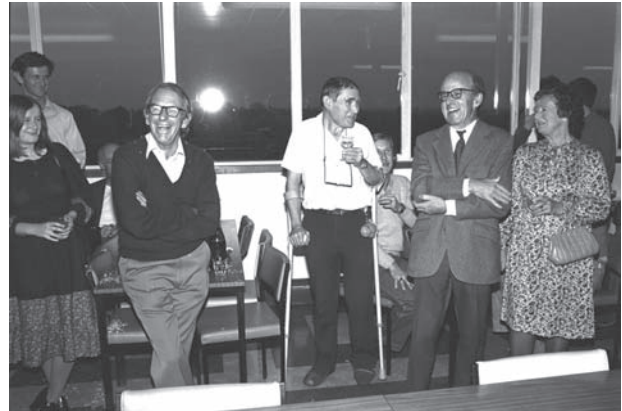
Frederick Sanger (left) with Sydney Brenner (center) and Max Perutz (right) at a social event at the MRC Laboratory of Molecular Biology in Cambridge [24]

students and postdoctoral fellows who had worked in the laboratory for several years.