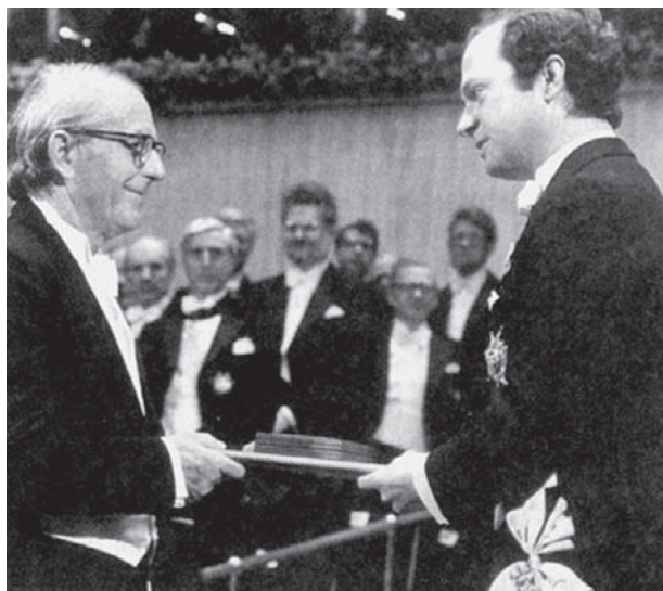
Frederick Sanger at his second Nobel Prize ceremony [30]

Frederick Sanger – the only person to have won two Nobel Prizes in Chemistry – died on November 19, 2013, at age of 95. His death was a great loss to the scientific community. Being described