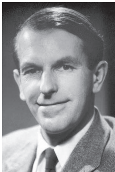
Frederick Sanger [3]