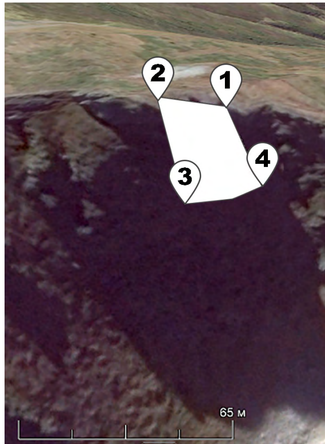
Figure 2. The site where Salix herbacea was sampled on the Maramures massif.

As a result of an inventory of certain herbarium collections, it was found that vouchers of S. herbacea hosted at the KW are the only known from the Maramures massif, and all of them referenced to the Pip Ivan