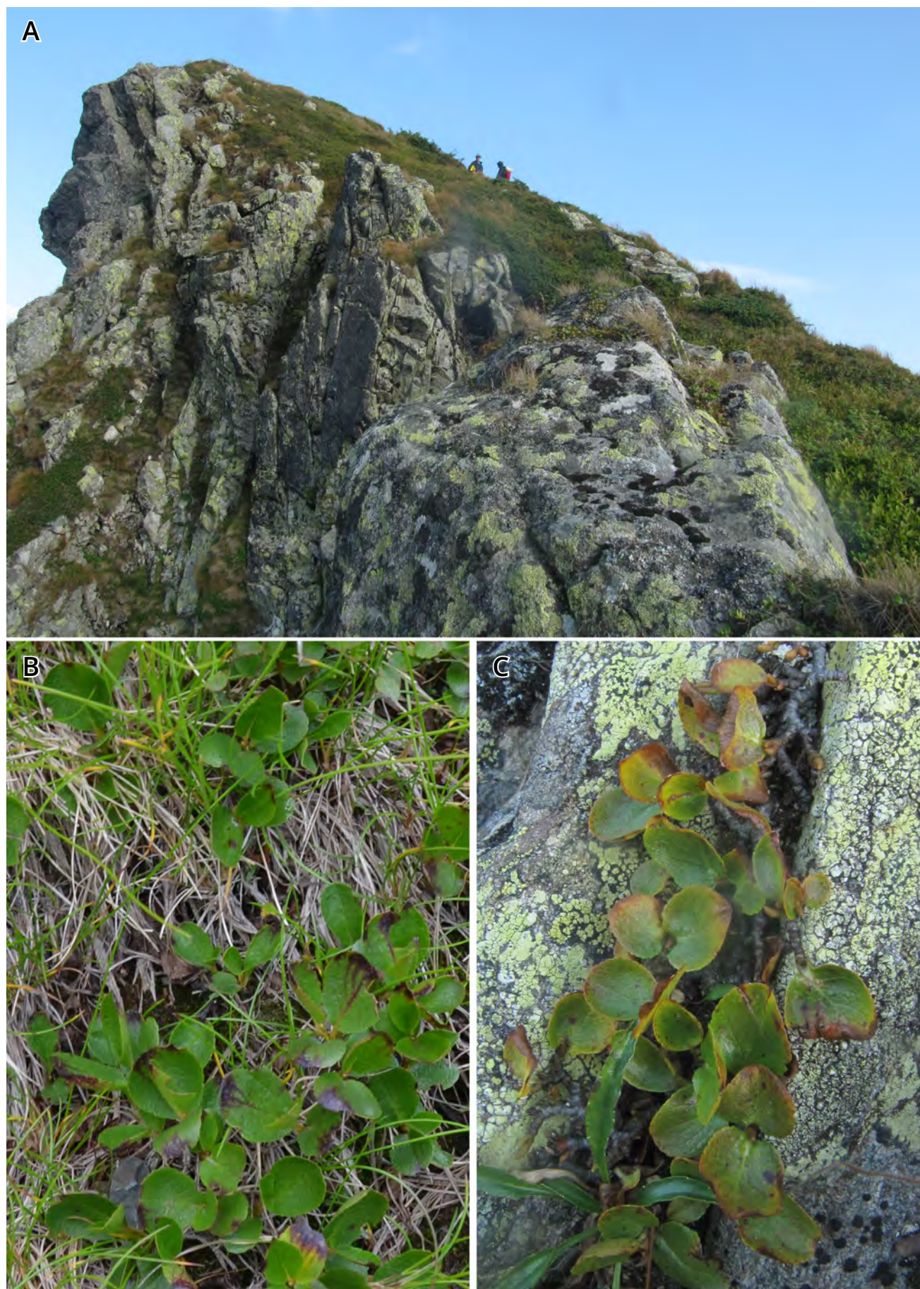
Figure 3. Salix herbacea on the Maramures massif: A – general habitat view, B – the lower overgrown part, C – the upper part.