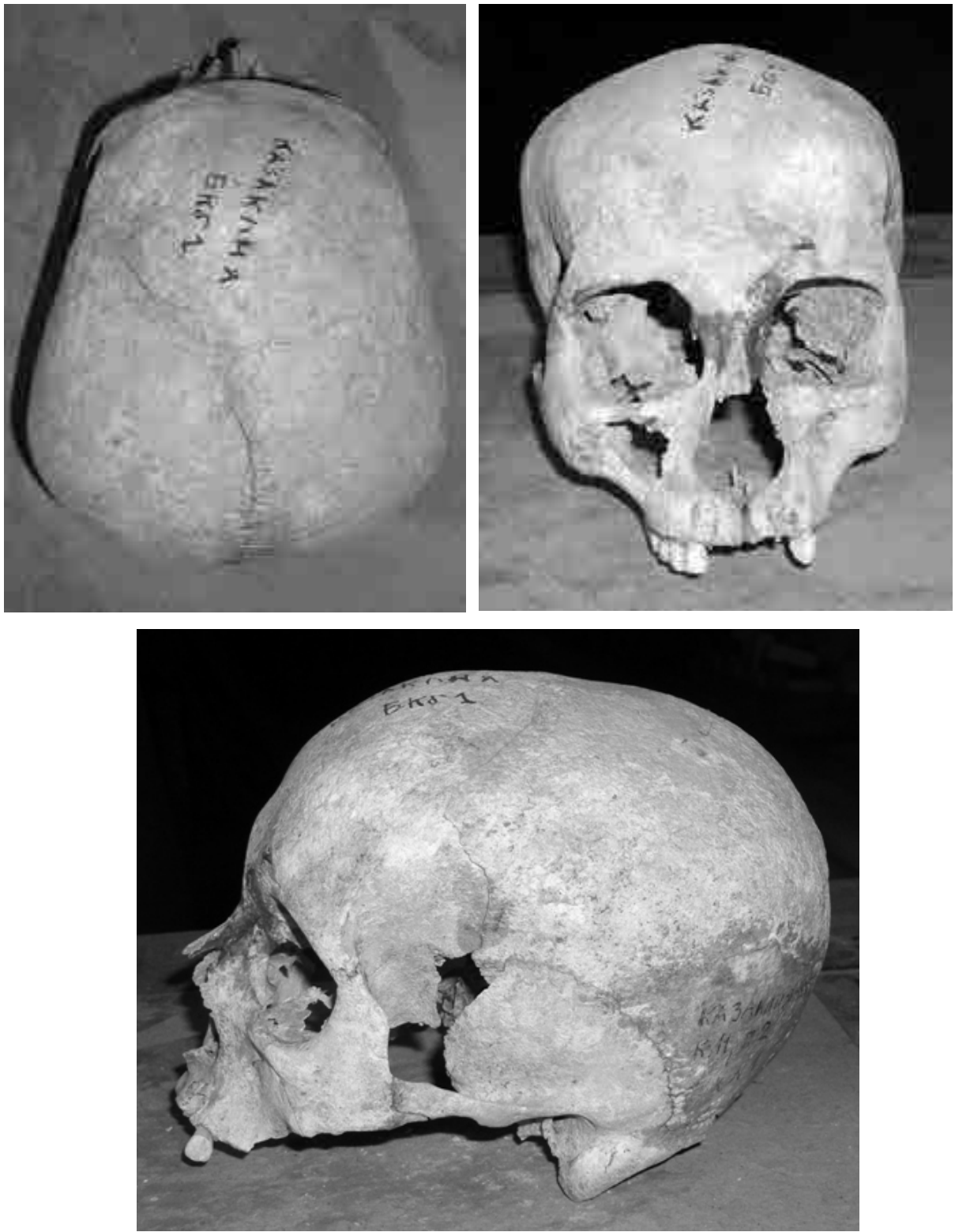
Fig. 4. Burial complex of Kazaklija, barrow 3, burial 13.