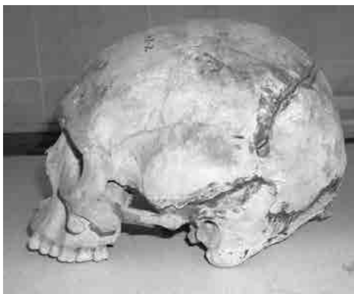
. 1. , 17, 5. Fig. 1. Burial complex of Taraklija, barrow 17, burial 5.