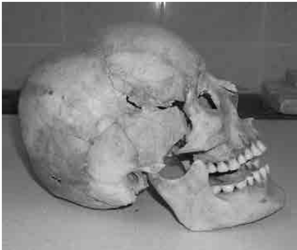
Fig. 6. Burial complex of Kotjuzhany, barrow 1, burial 5.