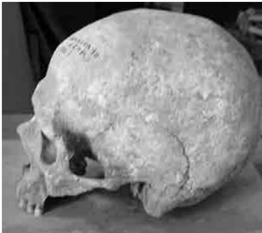
. 2. , 2, 14. Fig. 2. Burial complex of Taraklija, barrow 2, burial 14.