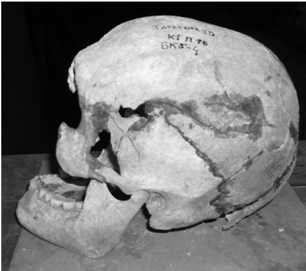
. 3. , 1, 16. Fig. 3. Burial complex of Taraklija, barrow 1, burial 16.