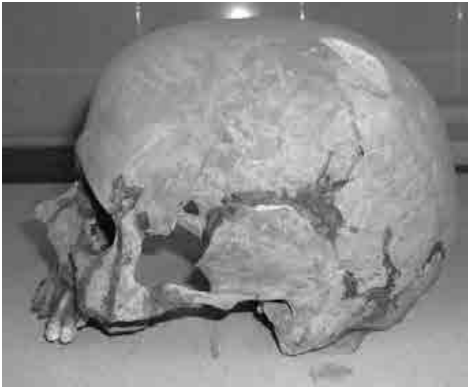
Fig. 5. Burial complex of Kotjuzhany, barrow 1, burial 1.