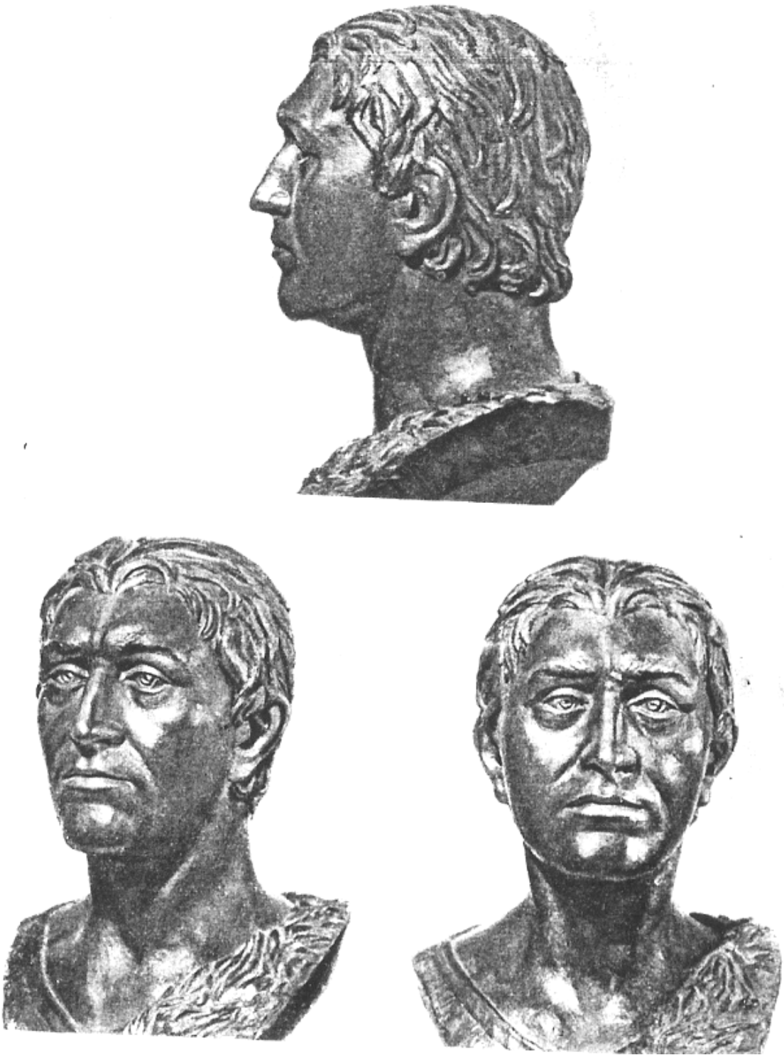
Fig. 8. Reconstruction, made by M. Gerasimov, based on the skull of representative of Yamna culture (Volga region).