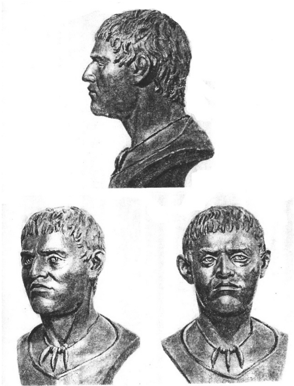
.7. ( ). Fig. 7. Reconstruction, made by M. Gerasimov, based on the skull of representative of Yamna culture (Volga region).