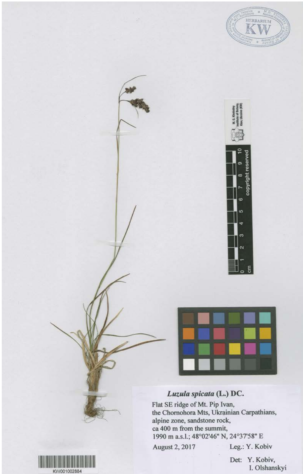
Fig. 1. A recent herbarium specimen of Luzula spicata from Mt. Pip Ivan in the Chornohora Mts