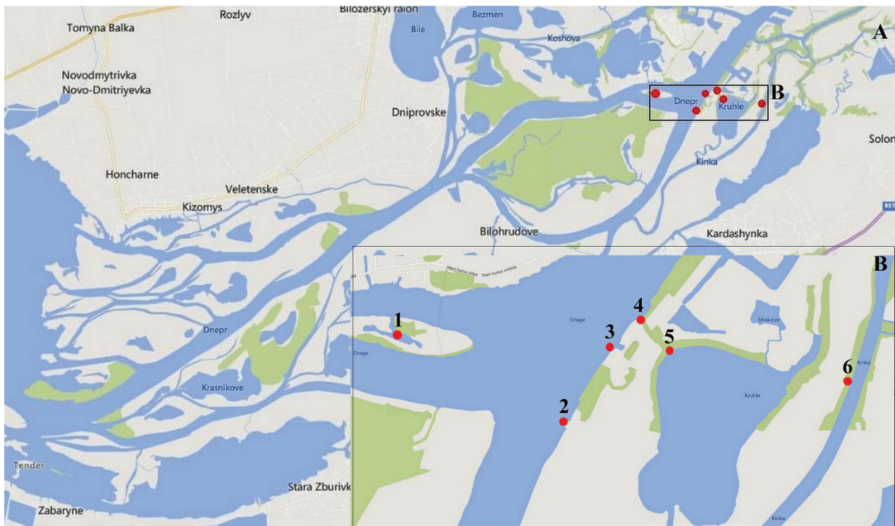
Fig. 1. Schematic map of new localities of Elodea nuttallii in the Lower Dnipro River