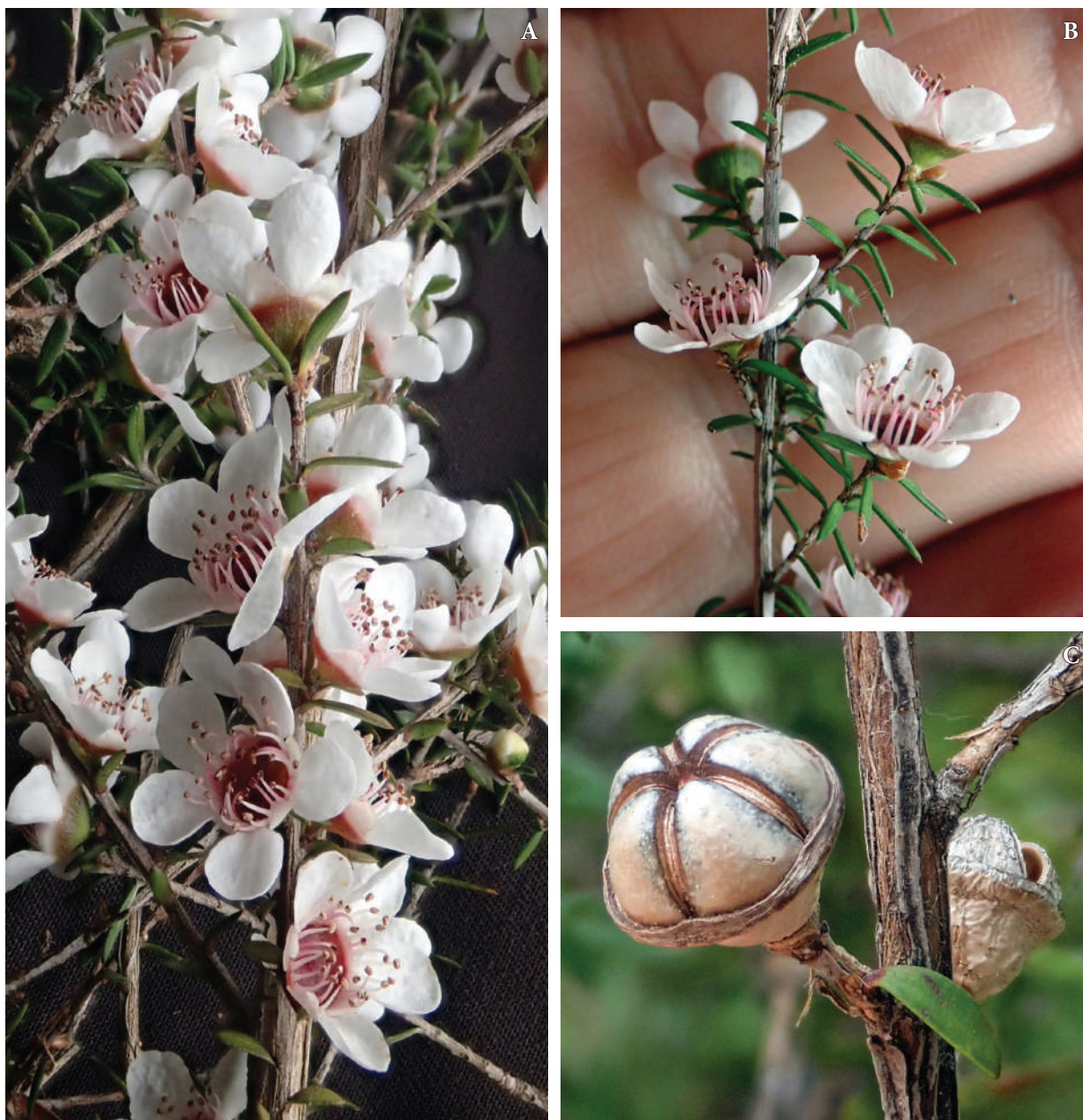
Fig. 5. Leptospermum tairawhitiense G.J. Atkins, de Lange & M.A.M. Renner. A: Mostly andromonoecious flowers showing subcampanulate shape, Tapuaeroa (Hikurangi Access) Road, Tapuaeroa River, Tairāwhiti / East Cape, Te Ika a Māui / North Island; B: Flowers showing subcampanulate shape, Tikapa Road, Tairāwhiti / East Cape, Te Ika a Māui / North Island; C: Mature, unopened capsule, Waipapa Stream, Tairāwhiti / East Cape, Te Ika a Māui / North Island

1.0 mm following anthesis, flat, initially green, or pink, darkening red at anthesis, finely papillate rugulose. Fruits — persistent, woody, (4.5–)5.6(–6.8) × (3.6–)5.5 mm (unopened), (4.8–)5.8(–7.2) × (3.8–)4.6 mm (opened), pale grey, broadly obcoic or hemispherical / globose, centre often with persistent