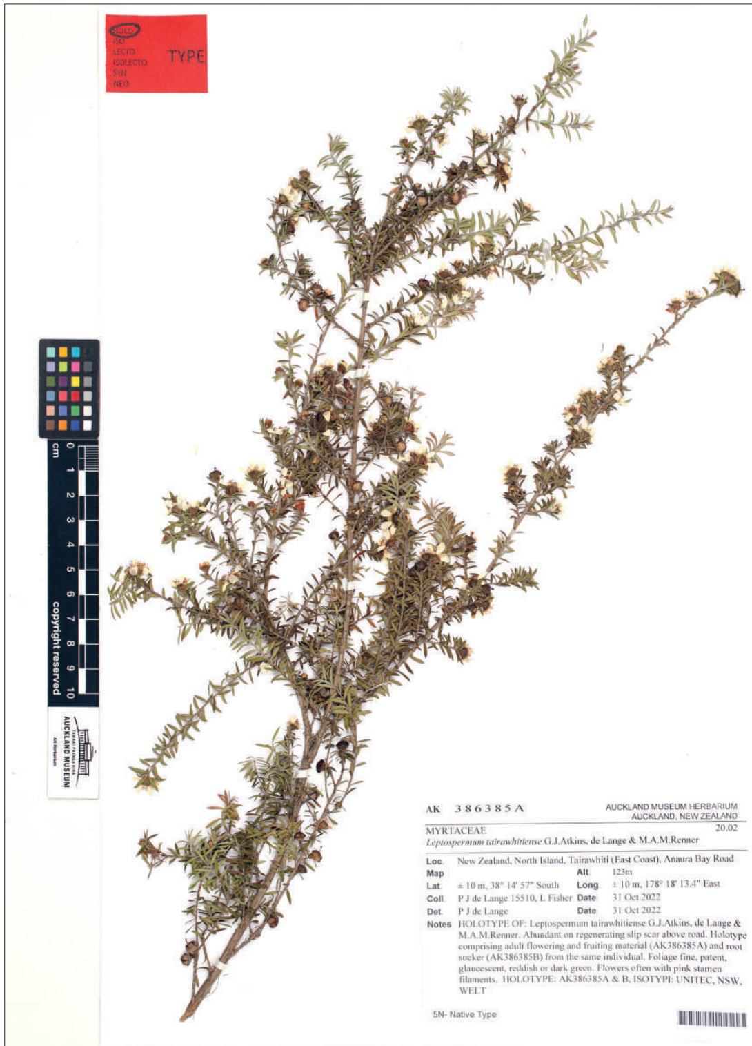
Fig. 2. Holotype of Leptospermum tairawhitiense G.J. Atkins, de Lange & M.A.M. Renner (AK386385A), specimen spread over two sheets, AK386385A and AK386385B (Fig. 3)