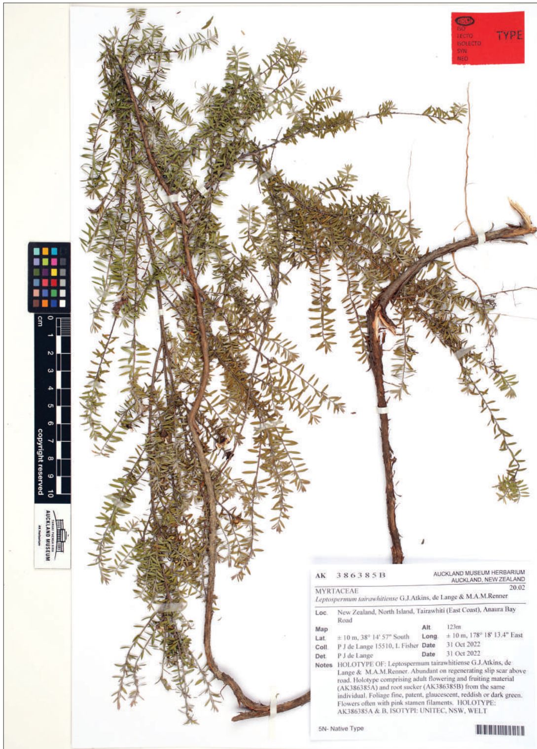
Fig. 3. Holotype of Leptospermum tairawhitiense G.J. Atkins, de Lange & M.A.M. Renner (AK386385B), specimen spread over two sheets, AK386385A (Fig. 2) and AK386385B