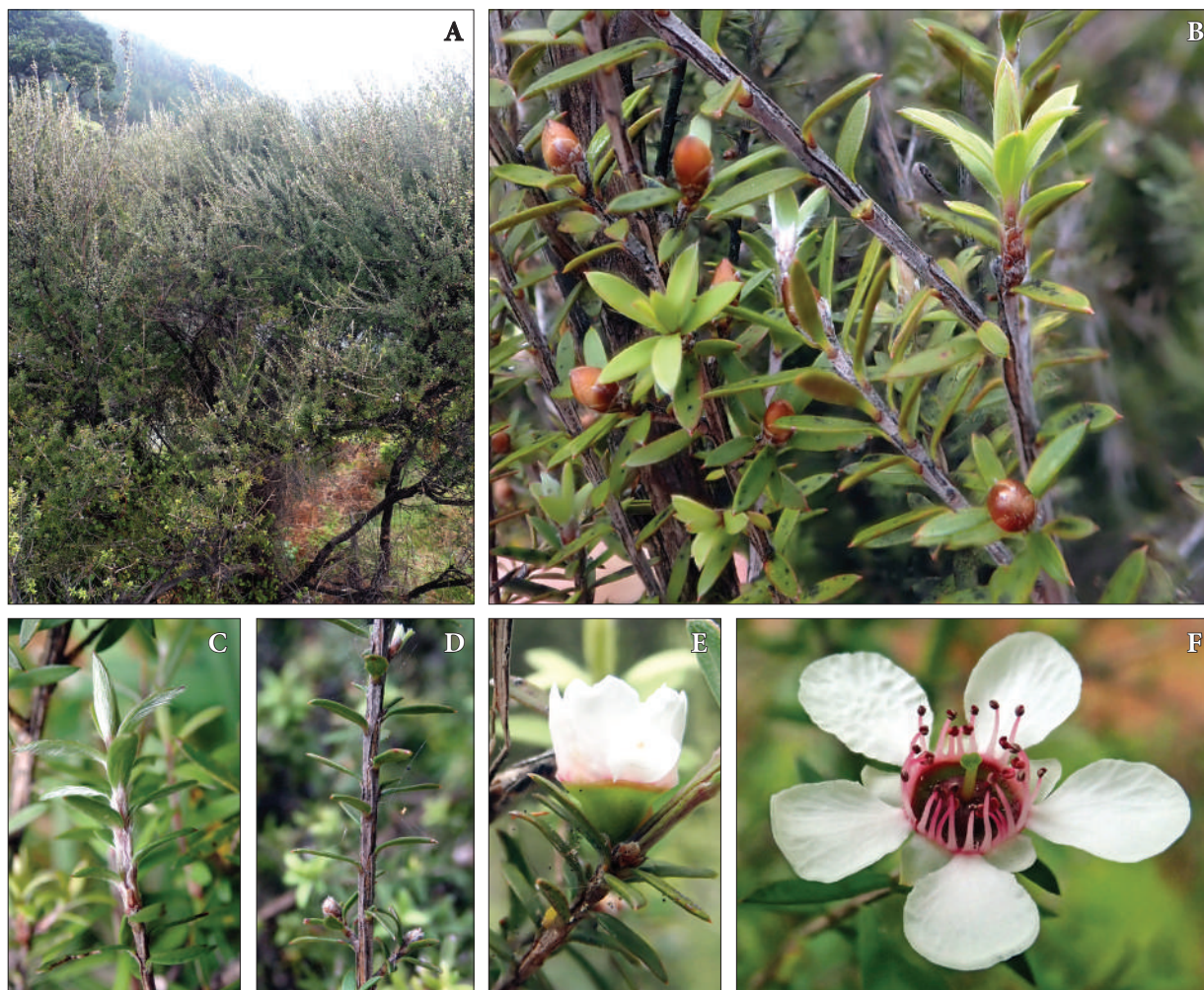
Fig. 4. Leptospermum tairawhitiense G.J. Atkins, de Lange & M.A.M. Renner. A: Growth habit, Waipapa Stream, Tairāwhiti / East Cape, Te Ika a Māui / North Island; B: Foliage, Waipapa Stream, Tairāwhiti / East Cape, Te Ika a Māui / North Island; C: Maturing leaves, showing indumentum, which is shed at the leaves, Lottin Point, Tairāwhiti / East Cape, Te Ika a Māui; D: Mature leaves, note the angle the leaves are positioned from the branchlet axis, Lottin Point, Tairāwhiti / East Cape, Te Ika a Māui / North Island; E: Opening flower, Waipapa Stream, Tairāwhiti / East Cape, Te Ika a Māui / North Island; F: Fully opened flower with spreading petals (unusual in this species) showing pink stamen filaments, Lottin Point, Tairāwhiti / East Cape, Te Ika a Māui / North Island

orbicular, apex obtuse, rotund, sometimes subtruncate, margins entire or finely crimped, oil glands not evident. Stamens — (20–)28(–32), arranged in 1(–2) whorls adnate to receptacular rim, filaments white or pink. Antisepalous stamens (2–)3(–4), antipetalous (2–)4–5(–6). Antisepalous stamens on filaments 1.0–1.8 mm long, incurved, erect or in mixtures of both. Antipetalous stamens erect or weakly incurved, sometimes petaloid, on filaments (3.0–)4.6–6.0 mm long, occasional inner whorl of 2 stamens present, these erect or