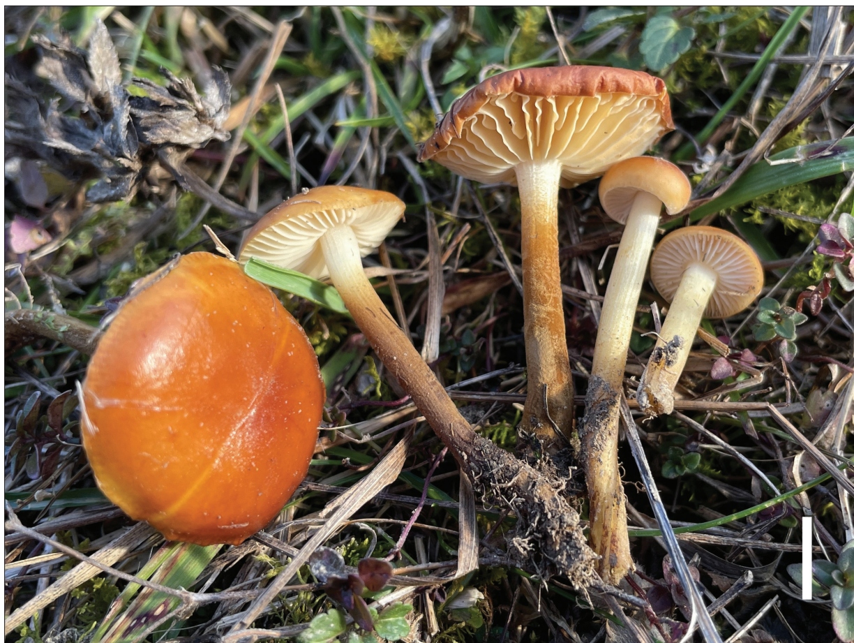
Fig. 1. Fruit bodies of Flammulina ononidis (KW-M71531). Bar — 1 cm

(VU) (Tkalčec et al., 2008), the Czech Republic — Critically Endangered (CR) (Holec, Beran, 2006), and Germany — Endangered (EN) (Dämmrich et al., 2016). As to Ukraine, F. ononidis was previously recorded only once, more than 50 years ago (Wasser, 1971). Unfortunately, its specimens have not been deposited in the herbarium and so cannot be investigated. Our collection represents the second locality of this rare fungus in our country and is worthwhile to be described more in details.