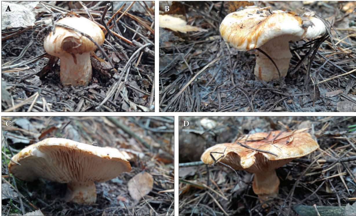
Fig. 2. Fruit bodies of Tricholoma focale . A: young fruit body; B: mature fruit body; C: mature fruit body showing hymenophore; D: mature fruit body showing hymenophore and ring on the stem

The first occurrences of the fungus as separate fruit bodies were documented in 1960 from seven localities in Zavorsklyanskyi mixed (subboreal) forests, along the pine terrace of the Vorskla River, within modern Poltava District in Poltava Region (Hanzha, 1960) (Table 1). After that, there were no more findings in this area, and all reports of this fungus in Poltava Region derive from these original records (Besedina, Stetsiuk, 2010).