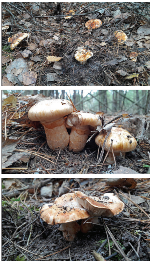
Fig. 1. Tricholoma focale , fruit bodies in situ , Kozyntsi village, Kyiv Region

where present. The total number of measured spores is 300. For scanning electron microscope (SEM) analysis, small pieces of hymenial lamellae were placed on metal stubs, then sputter-coated with gold and observed under SEM (Jeol 6060LA, Japan).