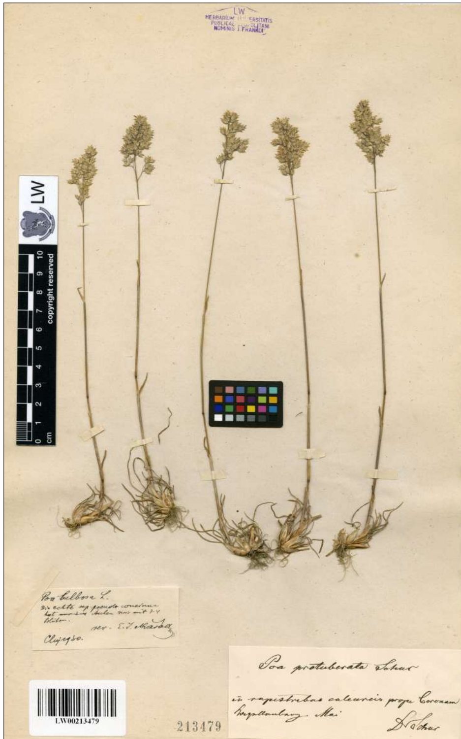
Fig. 1. Lectotype of Poa pseudoconcinna Schur (LW00213479), courtesy of the Herbarium, Ivan Franko National University of Lviv, Lviv, Ukraine