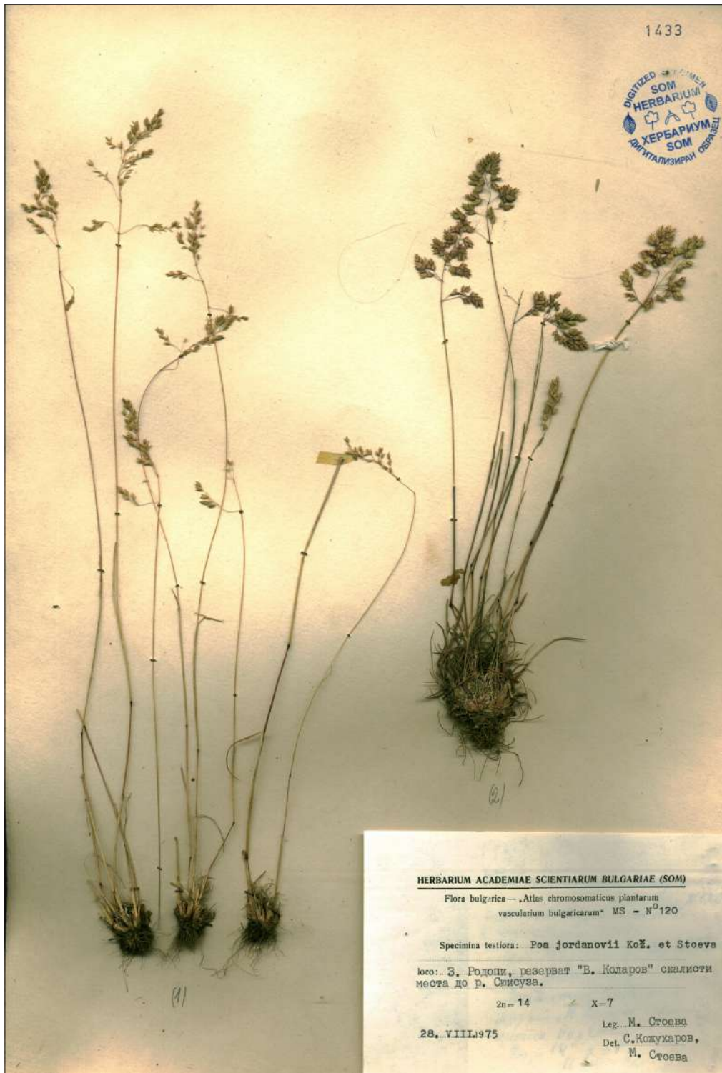
Fig. 2. Holotype of Poa jordanovii Kořuharov & Stoeva (SOM1433)