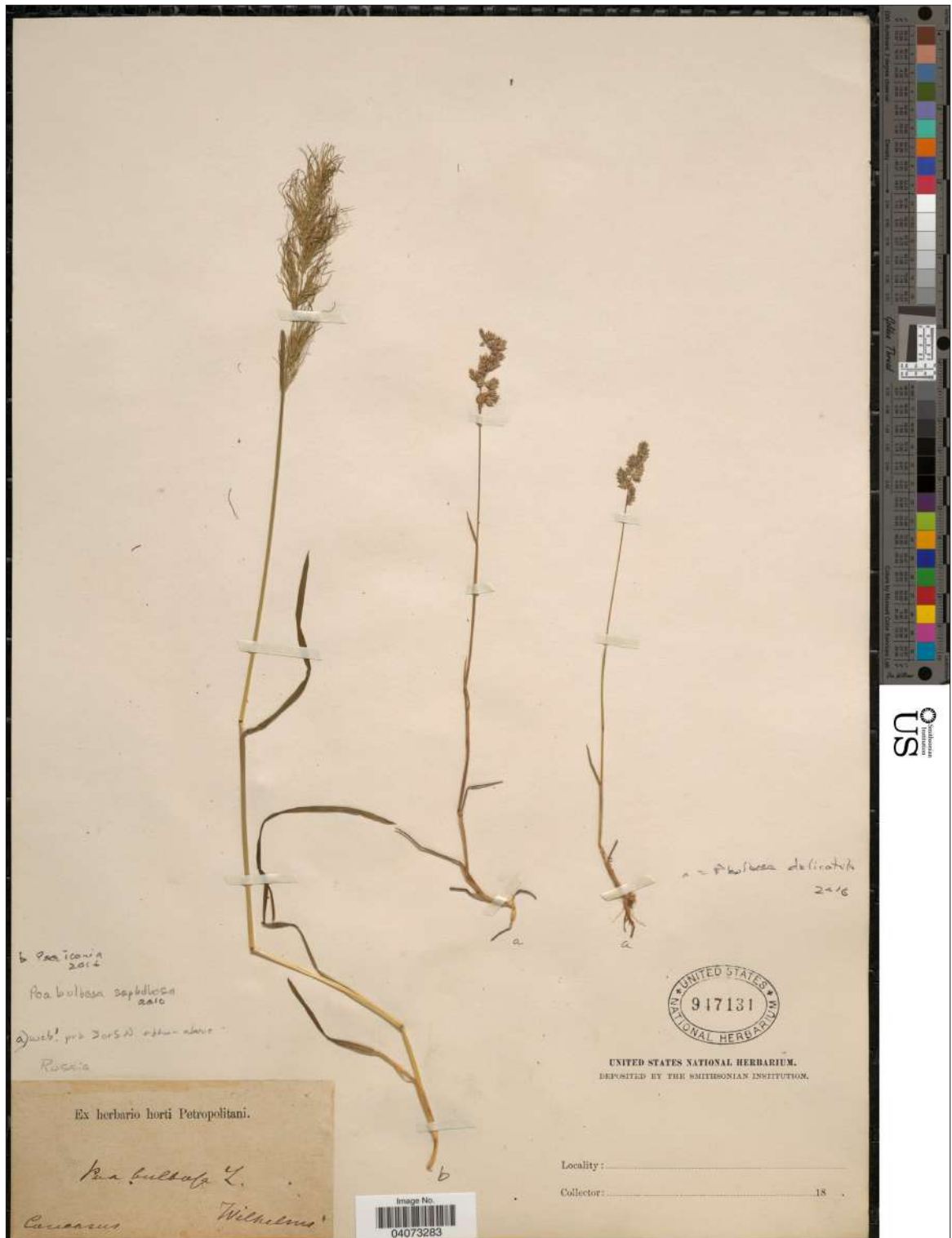
Fig. 4. Isotype of Poa delicatula Wilhelms ex Tzvelev (US04073283, pp. a), courtesy of the Department of Botany, Smithsonian Institution (pp. b = P. iconia Azn. var. iconia )