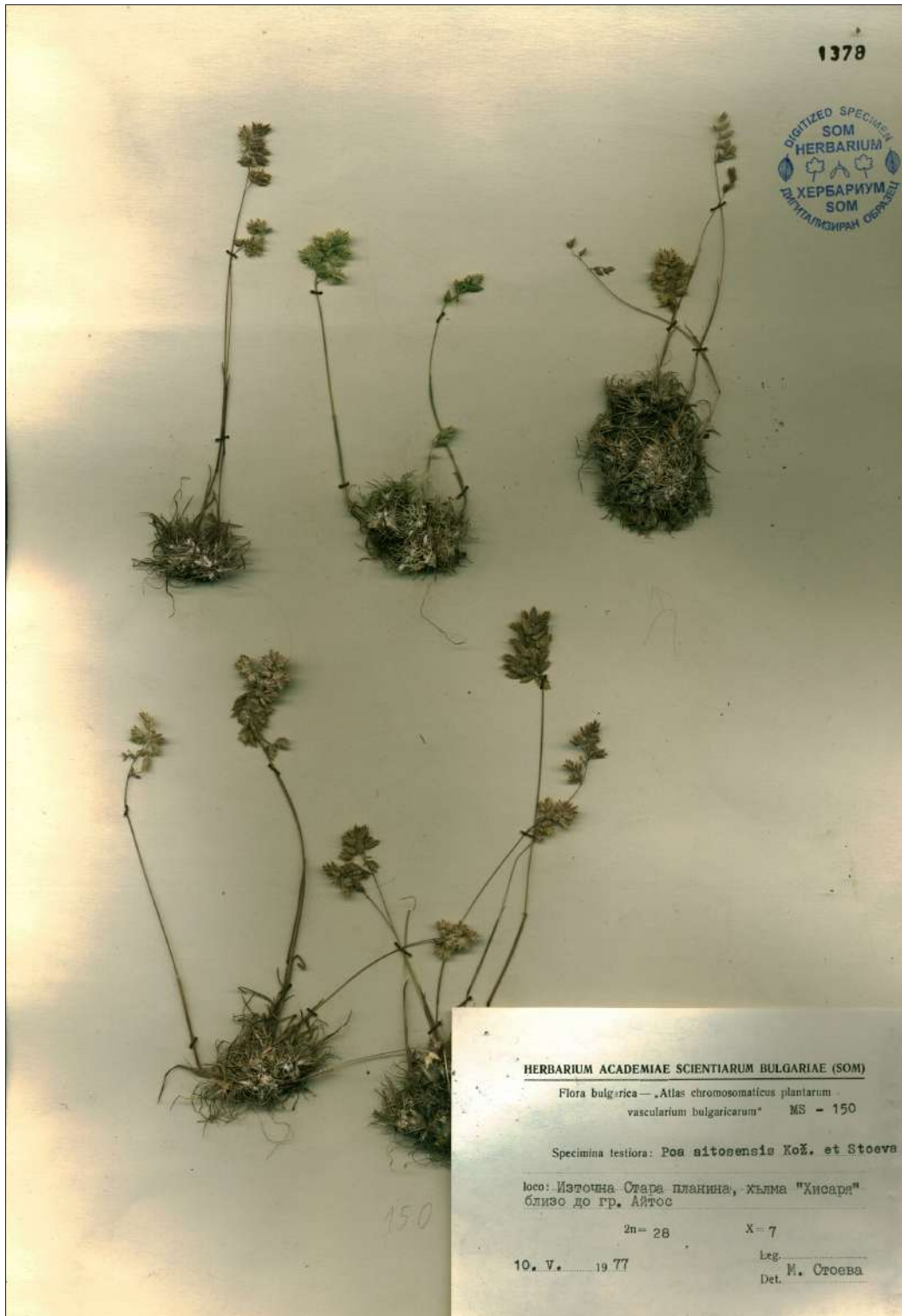
Fig. 5. Holotype of Poa aitosensis Kožuharov & Stoeva (SOM1378)