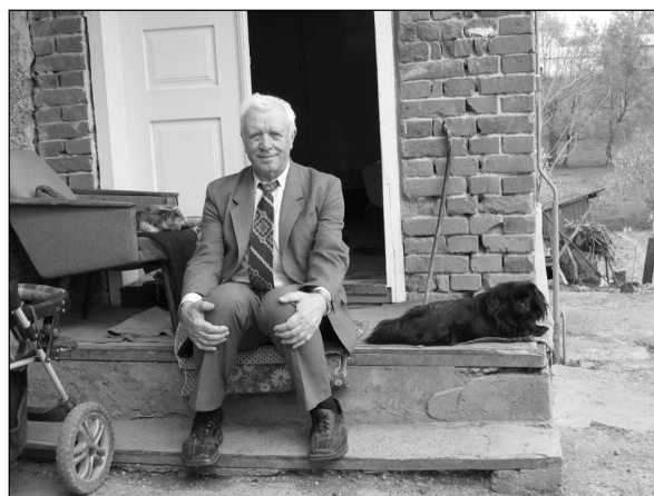
In the village in Ternopil region, 2008

Before talking about the second time, I have to describe my father's attitude to medicine. He was always an adherent of minimal medical intervention. He said that you cannot put your organism under manual control. When he was prescribed some kind of