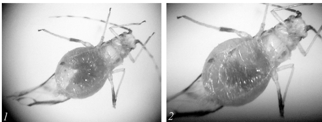
Fig. 1. Trioxys curvicaudus spins cocoon inside Eucalipterus tiliae : 1 — beginning of process; 2 — after 20 minutes.

In a process of mummy formation, when empty skin of consumed aphid is still soft, last instar larva makes a longitudinal cut on the medium of its ventral side. The larva slightly widens previously made cut and attaches the mummy to the surface of the substrate with silky glands secretions (fig. 1). Constantly moving inside the mummy in a circular pattern larva gives it a spherical shape. The larva moves horizontally clock-wise and then in an opposite direction. Movement of the larva head resembles the figure of eight ( \infty ): <movement to the substrate>—<attaching>—<movement to the mummy>—<attaching>. When moving inside mummy the larva is curved with its ventral part outwards, it makes one full circle in about 3 minutes. In 20 minutes, the material of T. curvicaudus cocoon slightly closed the cut in the aphid skin, and cocoon spinning was prolonged. During one hour of cocoon spinning observation larva rested several times;