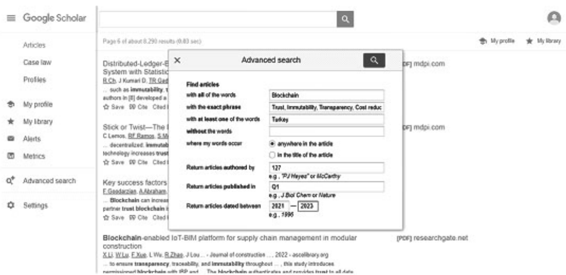
Fig. 2. Bibliometric results for the 127 articles published on Scopus and Web of Science in Q1 journals that investigate Blockchain and its relation with the four factors "Trust, Immutability, Transparency and Cost reduction" from 2021 till 2023, using the advanced search option on Google Scholar

A tamper-proof record of the entire supply chain process is provided by Blockchain technology during global trade and supply chains. Economic growth and stability are ultimately achieved by reducing operational delays, reducing stakeholder conflicts, and ensuring fair business practices.