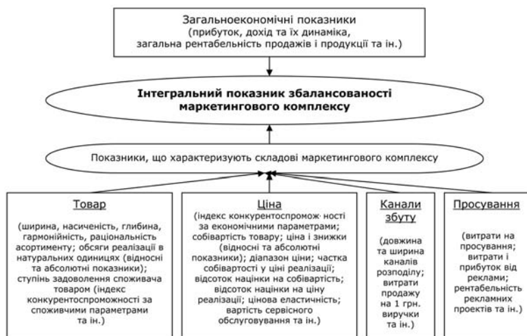
Рис. 2. Формування інтегрального показника збалансованості маркетингового комплексу