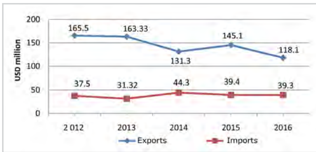
Fig. 2: Volume of exports/imports of services to/from African countries over the 2012-2016 period Source: Compiled by the authors based on [13]

As compared to 2015, the relative dynamic value of Ukrainian exports in 2016 was d_{dyn} = 1.02 demonstrating that exports of Ukrainian goods to African countries had an upward trend. However, when analysing the relative dynamic value of Ukrainian exports in 2016 as compared to 2012, we noticed that it had a downward trend with its d_{dyn} = 0.69 . A similar pattern was observed with regard to Ukraine's imports: the relative dynamic value of imported goods gradually decreased with d_{dyn} = 0.69 for imports of goods in 2016, if compared to the year 2012. Thus, a comparison between the turnover for 2015 and the turnover for 2016 suggests that the export and import transactions regarding both Ukraine and African countries had an upward trend. Yet, starting from 2012, the turnover had been negatively impacted, as illustrated by the dynamic value of exports/imports of services. In 2016, the major consumers of Ukrainian goods and commodities in African countries were Egypt (with its specific weight equal to 58.44% of the total Ukrainian exports to African countries), Algeria (6.07%), Libya (6.43%), Morocco (6.94%) and Tunisia (5.76%) [13]. Ukraine's main exports to African countries in 2016 are shown in Table 1.