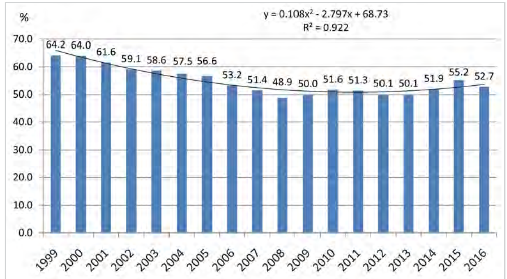
Fig. 1: The share of expenditure on food and non-alcoholic beverages in the structure of total costs of the Ukrainian households, %

In our opinion, the 60% threshold value of the affordability of products indicator is unreasonably high. According to the FAO methodology, households that send 40% of their income to purchase food are called low-income and food-insecure. Given that poor households do not make savings, 40% is the share of expenditure on food in the structure of total household expenditures [22, 10].