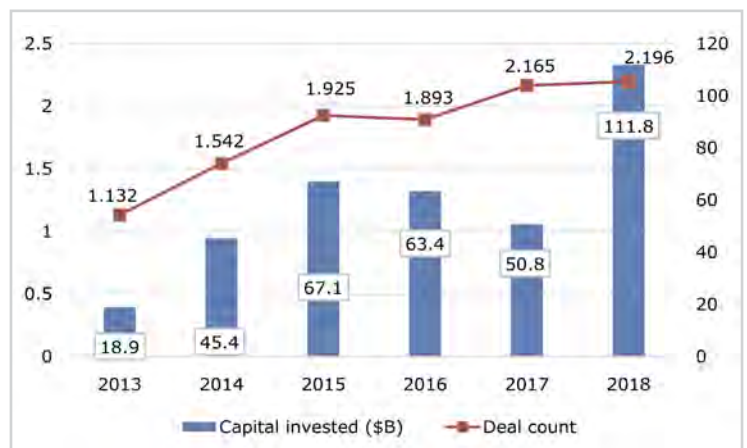
Fig. 1: Total investment activity (VC, PE and M&A) in Fintech 2013-2018 Source: Compiled by the authors based on [16]

Such cooperation can benefit both banks and organisations implementing innovative technologies in the process of providing financial services. From banks' point of view, it is