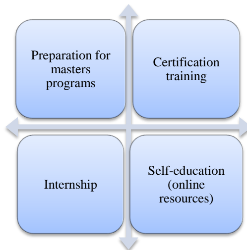
Fig.2. Types of vocational training *

We can see the types of vocational training in Fig.2.