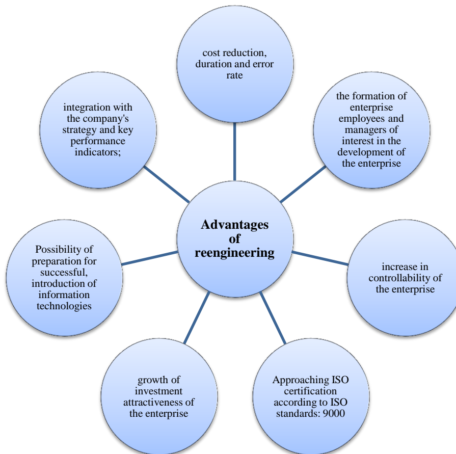
Fig. 2. Benefits of reengineering business processes at the enterprise

However, if the above errors can be avoided or minimized, then, of course, the reengineering of business processes at the enterprise makes it possible to feel its main advantages (Fig. 2).