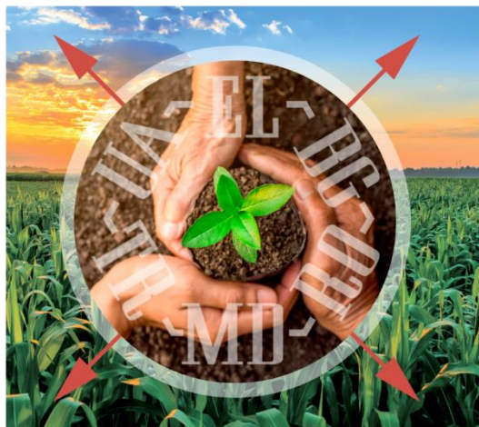
Fig. 3. The project eMS BSB 383 "Sustainable Agricultural Trade Network in Black Sea Basin -AgriTradeNet"

The incentive for the development of organic beekeeping is a higher price and a steady demand for its products. The quality of the products depends on how well-off the environment in the area of the apiary location, as well as how carefully the beekeepers meet the relevant requirements for the maintenance of bee families and the production of beekeeping products.