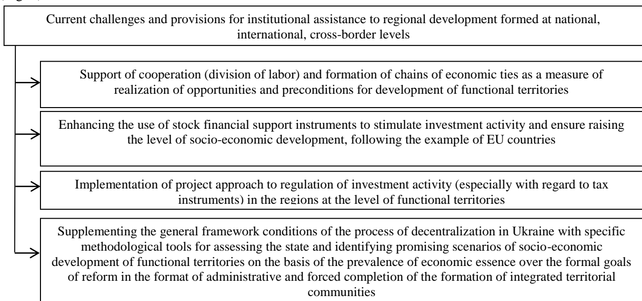
Fig. 2 Vectors of policy formation to stimulate economic development in conditions of globalization and decentralization

The analysis of the majority of normative documents regulating the development of the economic system of the country at local, regional, national, cross-border and international levels revealed that the key problem for the institutional framework is its generalization, lack of specific mechanisms, instruments and measures of economic, organizational, tax, administrative, information impact, as well as methodological approaches to assessing the state of local, regional economic systems in the context of reform and to assessing the appropriateness of the application and effectiveness of certain regulatory measures. In accordance with the identified challenges, relevant for the national economy is a list of vectors for shaping the policy of stimulating economic development in the conditions of globalization and decentralization (Fig. 2).