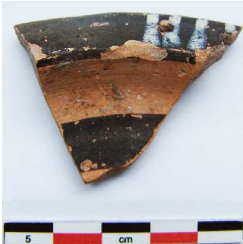
Fig. 14. North-Ionian thin-walled lamp with incurved rim and central cone