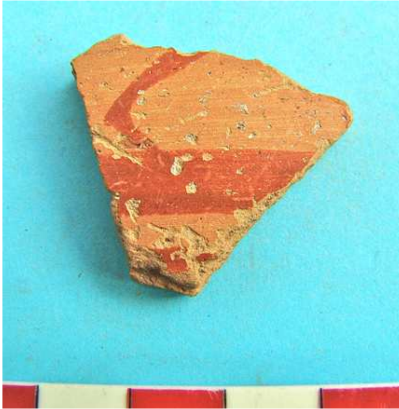
Fig. 12. North-Ionian b.f. sherd (or Histria imitation?)