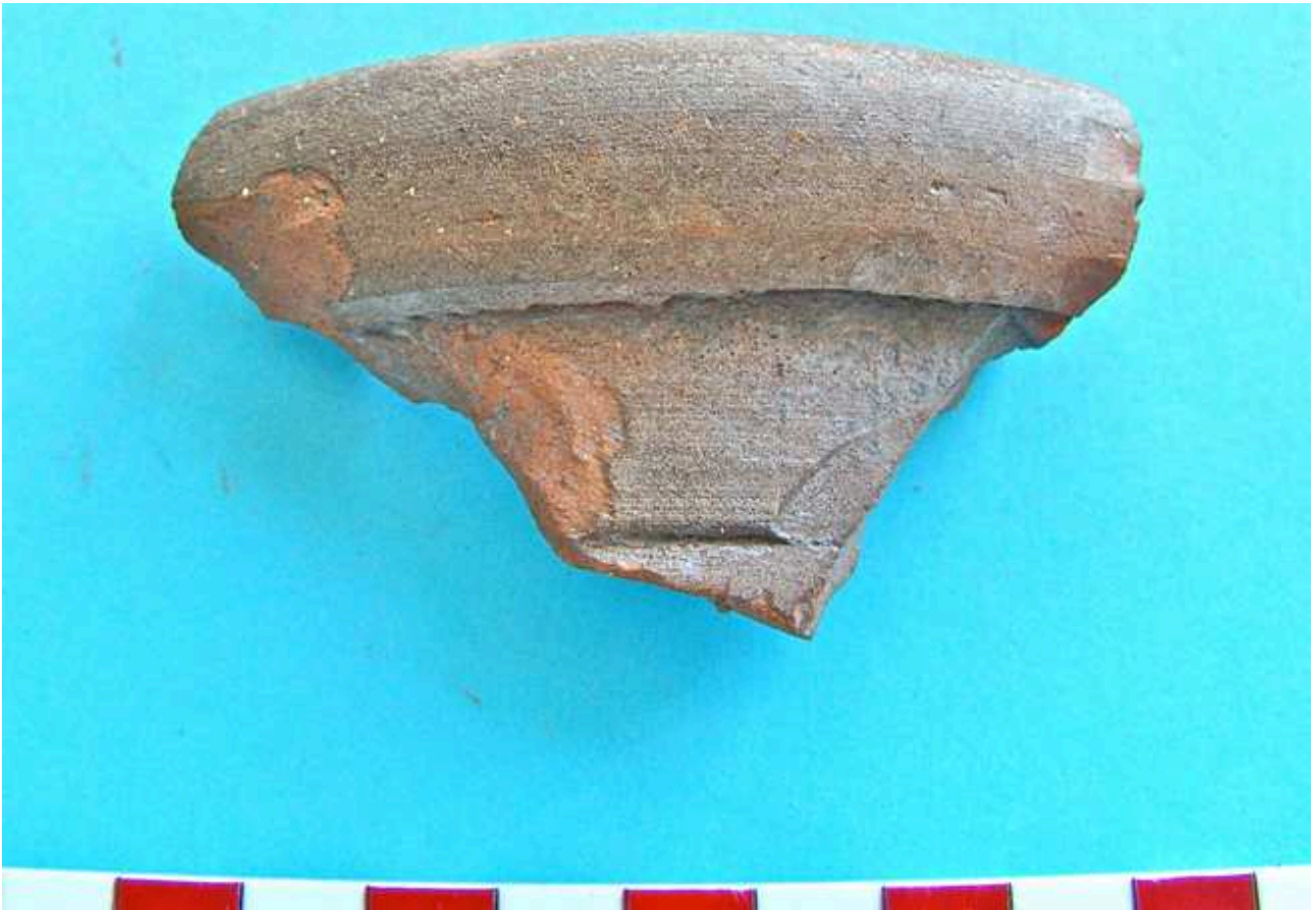
Fig. 6. Transport amphora of Zeest's «Samian» type