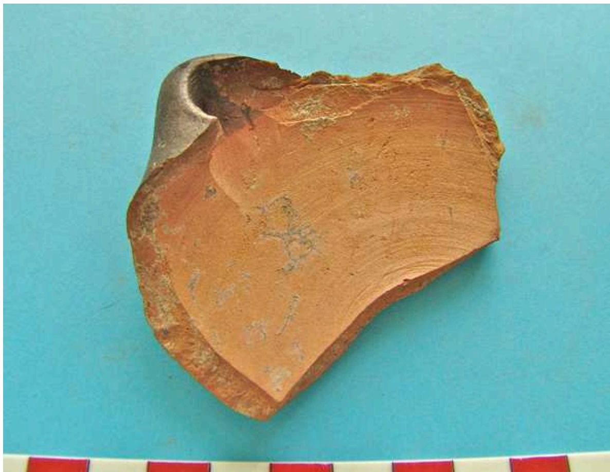
Fig. 15. Grey ware lekane of Histrian type