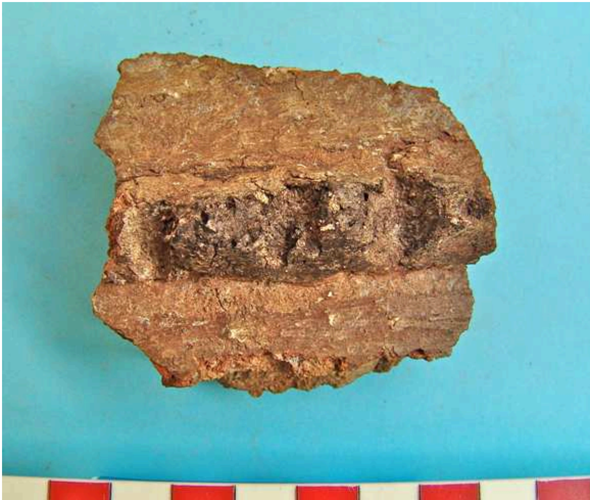
Fig. 1. Wall fgt. of Getic handmade pot with digital impressed decoration