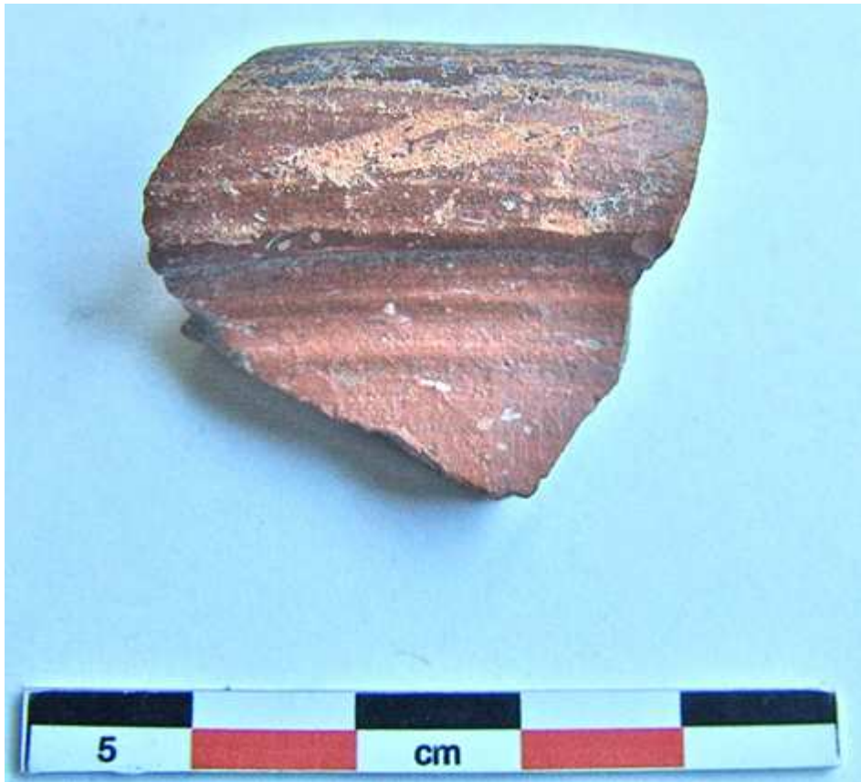
Fig. 10. Transport amphora of «la brosse» type?