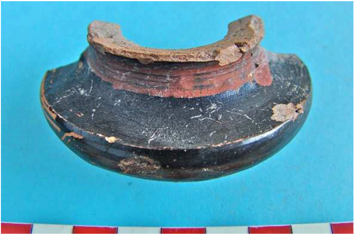
Fig. 8. Attic black-glazed cup of type C