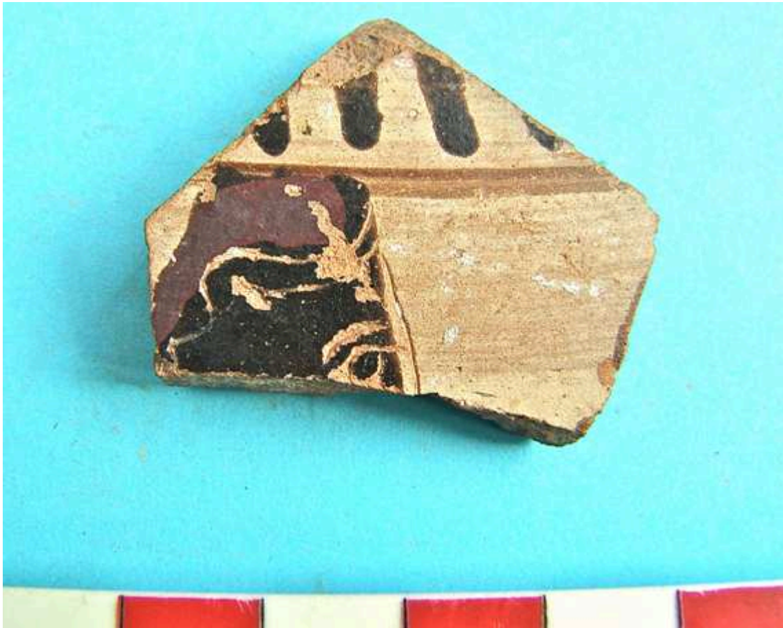
Fig. 4. Pseudo-Corinthian sherd (North-Ionian manufacture?)