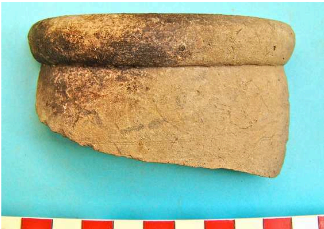
Fig. 7. Transport amphora of Chian swollen-necked type with unpainted rim