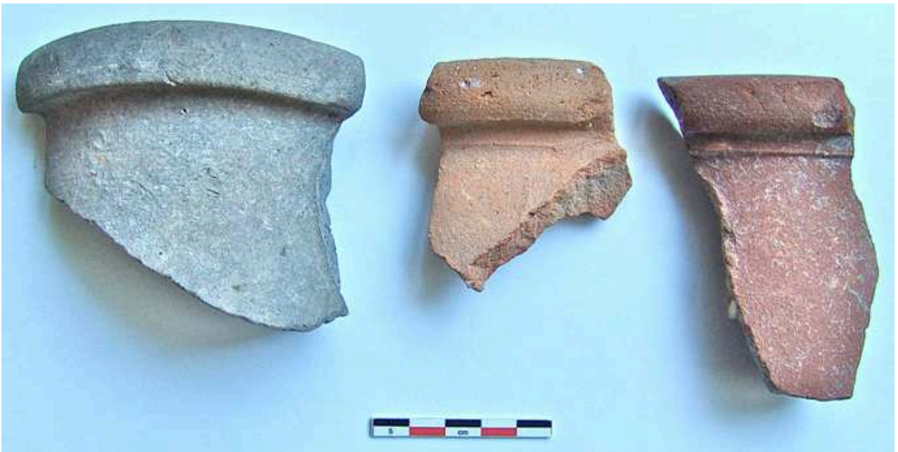
Fig. 9. Transport amphorae of Lesbian type