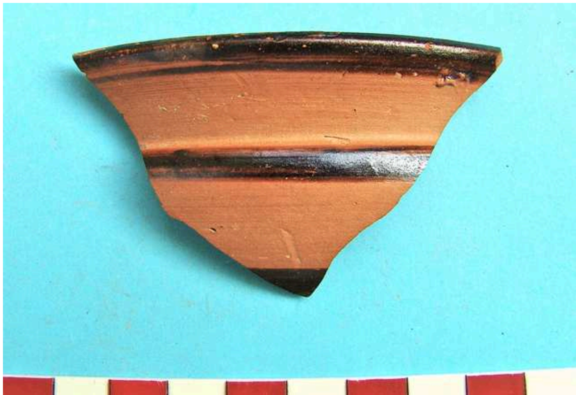
Fig. 3. Ionian cup of Villard B2 / Hayes VIII type