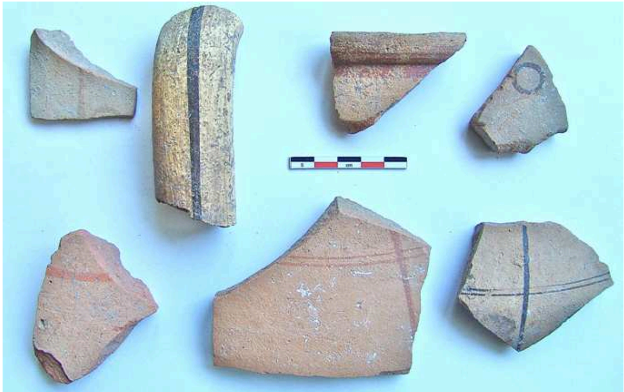
Fig. 2. Transport amphoras of Chian type; early variants