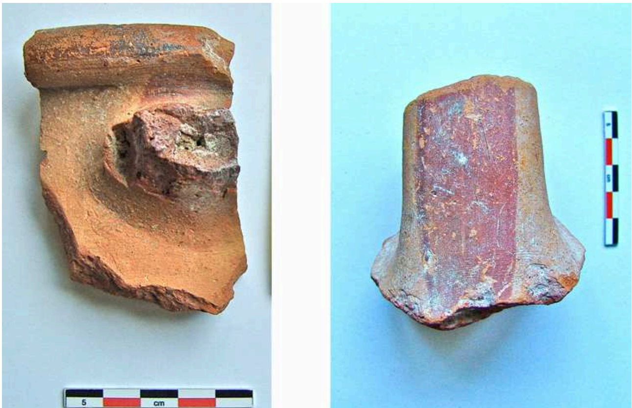
Fig. 5. Transport amphoras of Clazomenian type