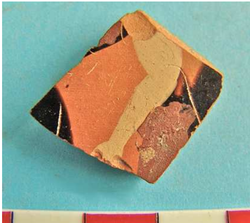
Fig. 13. Attic black-figure pot