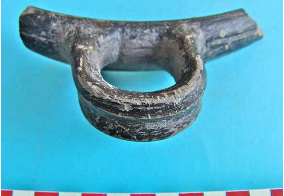
Fig. 16. Spindle whorls, either Greek or native?