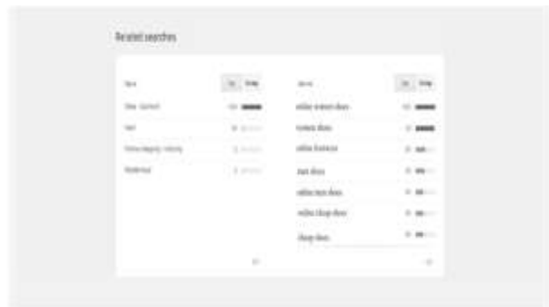
Fig. 2. Google Trends results regarding related searches

A good keyword research strategy is to check everyone in Google Trends to see evolution and seasonality during the year (Fig. 2).