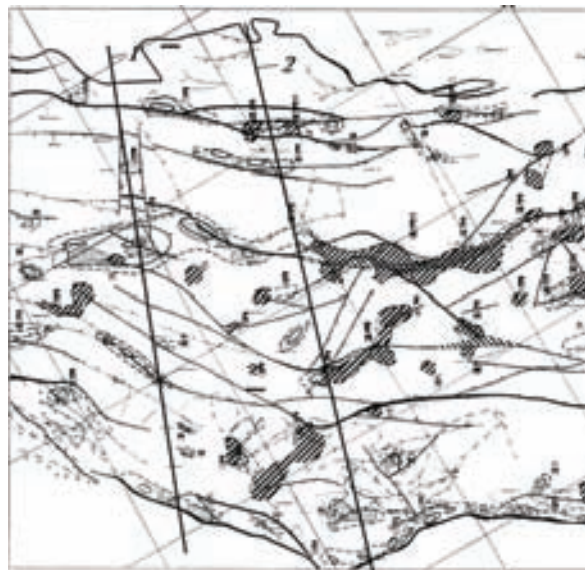
Fig. 1. Locations of seismic reflection profile Zachepilovka — Belsk (1) and Mikhailovka — Prokopenki (2) in the central part of the Dnieper-Donets Basin (DDB).

and temperature in a 2D block-structured geophysical medium [Starostenko et al., 1999; 2001]. Using the kinetic energy of block k in functional form: