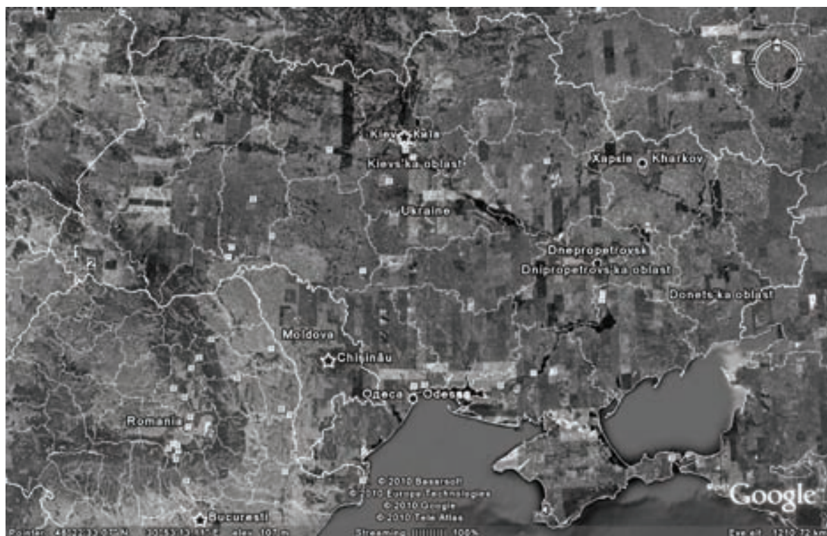
Points of extensometric researches in Ukraine (marked by red triangle): 1 — RGS "Beregove"; 2 — RGS "Koroleve"; Geophysical Observatory of TNU (AR Crimea, Sevastopol, Cape Chersonese).

country (Figure). In Transcarpathians the quartz extensometers was working [Latynina et al., 1992; 1993; Verbytsky et al., 2003; Verbytsky, Nazarevych, 2005; Nazarevych, 2006]. Now works 3 de-