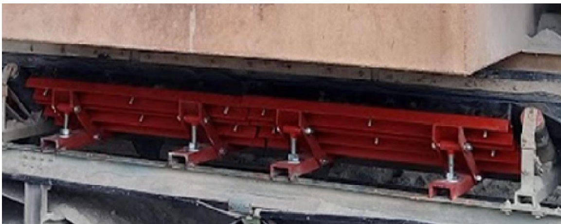
Figure 4 – DPL800/7

Other transport routes (piping for exhausting of fine parts filtration equipment): one of the most stressed places in terms of abrasion. The pipe is manufactured in class II. and II., increased durability ensures internal lining, usable are anti-abrasive rubbers and smooth polyurethanes. Example No.6: combination of rubber and polyurethane lining, Figure No. 7: rubberizing the internal parts of the filter station [4].