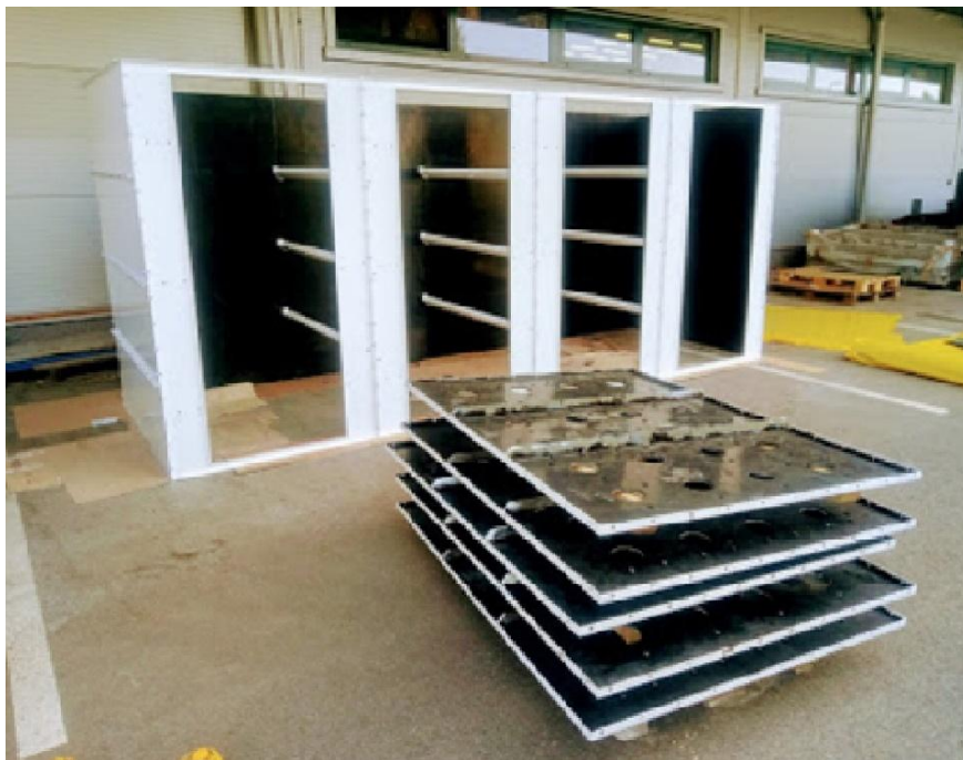
Figure 7 – Rubberizing of filters