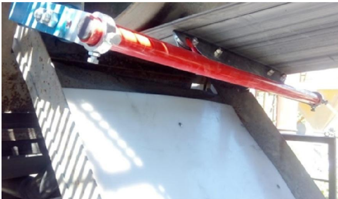
Figure 5 – Wiping technique