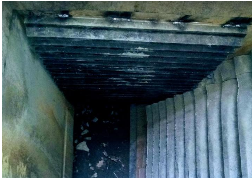
Figure 1 – Tooth plate VSS60-80 mm

We cannot do this without quality hard rock shop windows with a thickness of about 20 mm supplemented with tooth plates type VSS60-80 mm. See Fig. 1 by combining these materials, we can maximize the service life of the transport route.