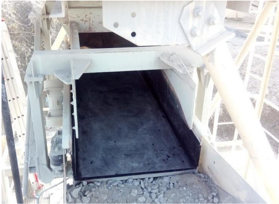
Figure 3 – Rubber lining gLB 60/CN 10mm