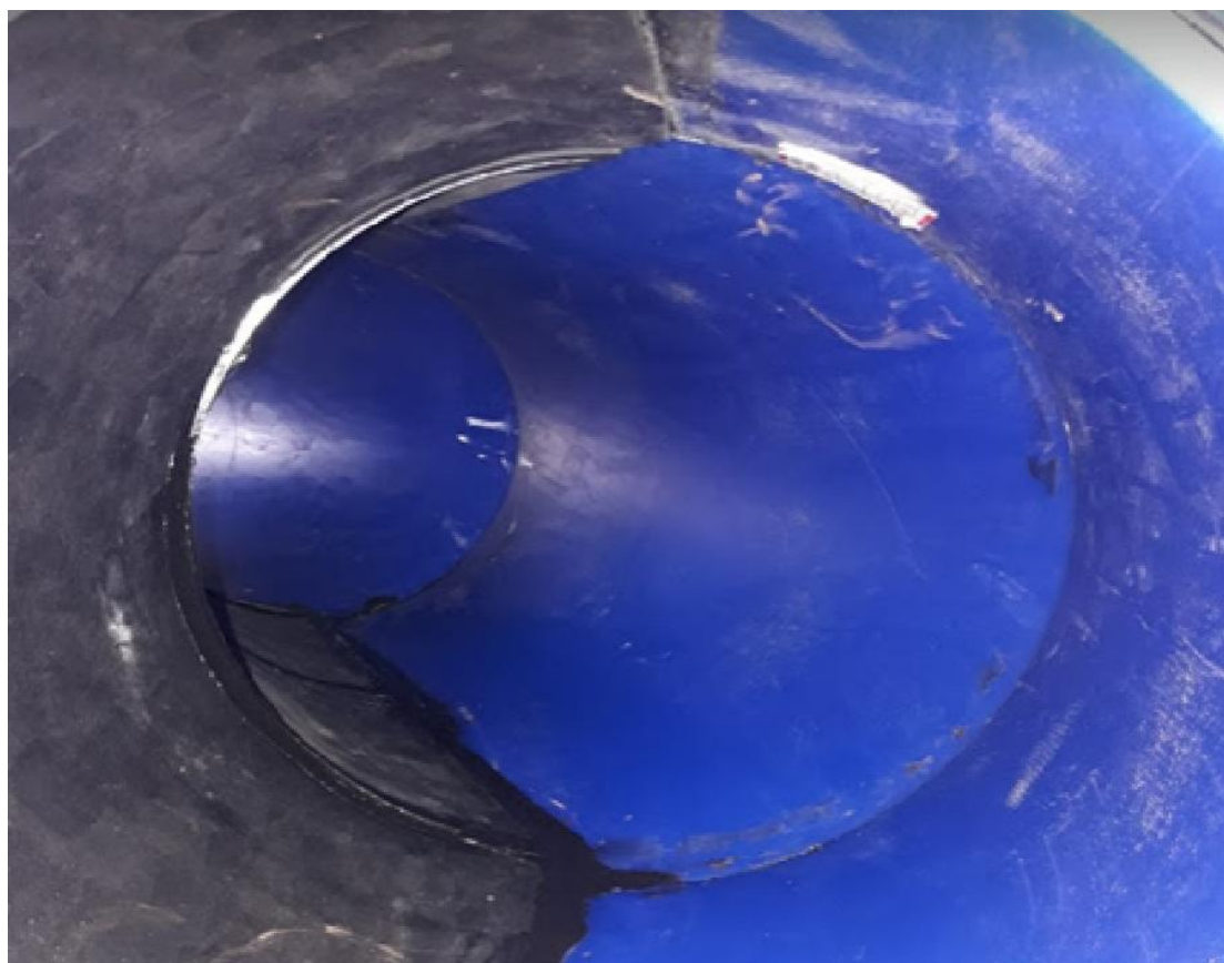
Figure 6 – Pipe unloading