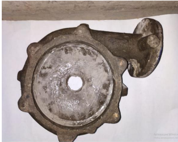
Figure 3 – Finished volute casing

Conclusion. The studies performed made it possible to make the following conclusions.