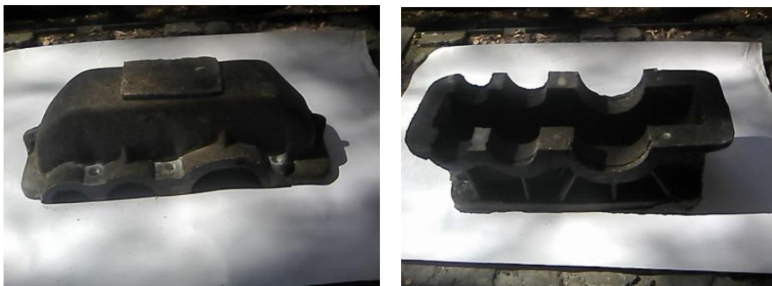
Figure 2 – Finished gear case

According to the results of carried out studies the gear case (Figure 2) and pump casing (Figure 3) were manufactured through casting. Both items passed bed tests and showed good results in operation.