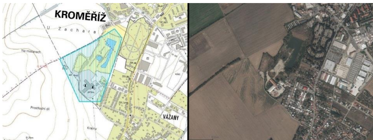
Figure 1 – Mining area of clay pit in Vazany (left) and satellite view (right)

Introduction. There is an obligation in Czech Republic to liquidate the mines after the mining is terminated stipulated by Act No. 44/1989 Coll. about protection and utilization of mineral resources (Mining Act) [1]. Mining organization is according to § 32 of this Act obligated to provide a Plan for the opening, preparation and extraction of mineral deposits which also includes the Project of remediation and reclamation. During the liquidation of extracted and unused mining area several complications may occur. These should be resolved by the mining organization, which was carrying out the mining, (Fig. 1).