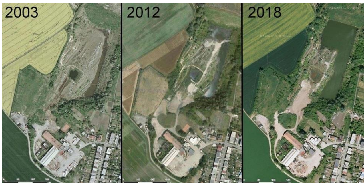
Figure 5 – Development of clay pit from the ceasing of mining to the current time

Supplement to the Plan of opening, preparing and extraction from 1978 expanded the mining area to 188 m above sea level and changed the method of utilization of the excavated area to a controlled landfill of solid municipal waste. In the next phase was to be reclaimed for agricultural purposes. For the technical parts of reclamation filling up with technological material such as excavation dirt or construction waste is assumed. The area covered by this project is limited by the municipal landfill Vazany – Zachar to the north and the border of the area of brickyard to the south.