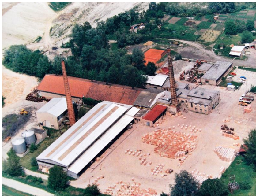
Figure 2 – Brickyard in Vazany in 1994

The seasonal production at that time reached close to 5 million bricks a year. The brickyard has shut down in the 90's, (Fig. 2). During the restitutions the whole abandoned and decaying area was returned to its original owner. This owner had the brickyard and clay pit up until 2019, when the right of disposal was passed on to Biotrend Morava LLC. This company is at present according to the effective legislation required to ensure the closure of the unused mining area, which is preceded by liquidation of all main mines, including reclamation of the affected area.