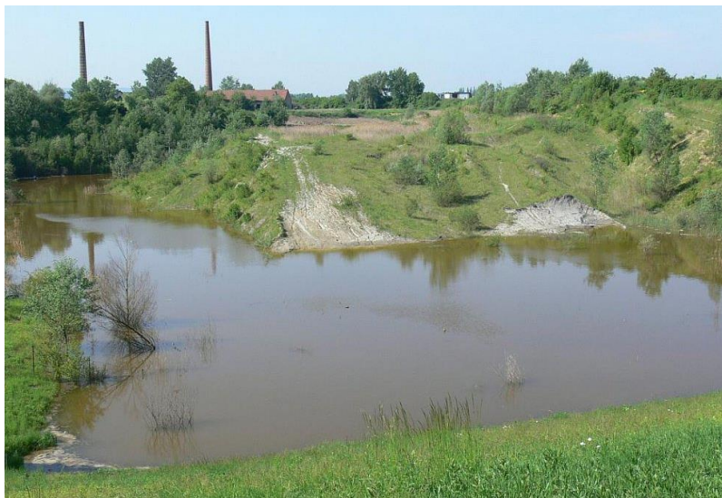
Figure 4 – Lake of mine drainage

The slopes and bottom of the landfill in the deposit area is isolated by airtight and waterproof barrier made from polyethylene foil. The western slope is isolated by several layers of clay. Water drainage's monitoring is carried out from the drillings holes and collecting sump. The sump has two chambers and is used to measure the parameters of the drainage system, which drains the water under the landfill. In the other chamber infusion water is collected and then compared with the sewerage's limits. The infusions are not proved to have exceeding amounts of harmful substances which could have been pumped into the city's sewerage.