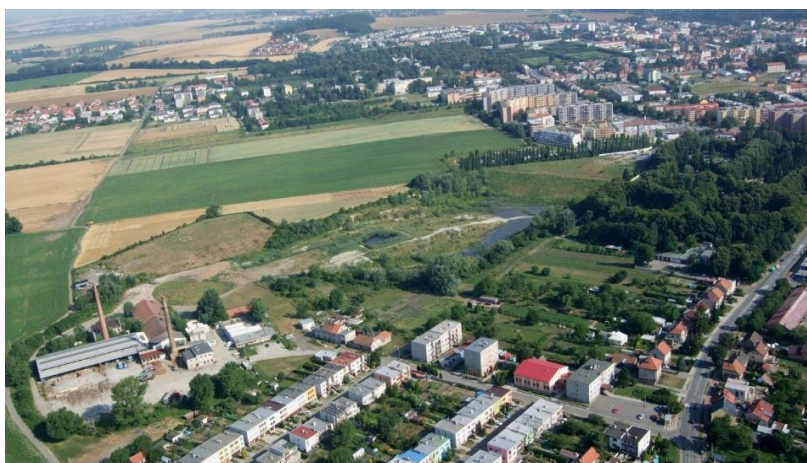
Figure 3 – Clay pit, former brickyard and housing estate

Because of the contact of mine drainage with the frontal slope of the reclamation landfill and because of the technical aspects of the reclamation, it will be necessary to pump the mine drainage into the surface water during the reclamation.