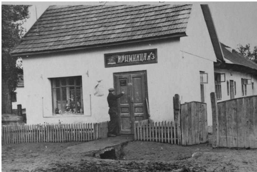
Foto 5. The archived photograph of Istvan Pasztellak, a member of the political group of Galoch, while showing where they placed their flyers 5 Фото 5. Архівна фотографія Іштвана Пастеллака, члена політичної групи з Галоча, під час показу, де вони розмістили свої листівки