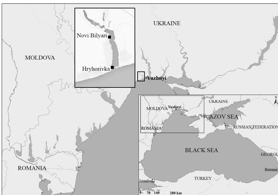
Fig. 1. Geographical location of Hryhorivsky Estuary.

The R software (R Core Team..., 2016) was used for the analysis and graphics.