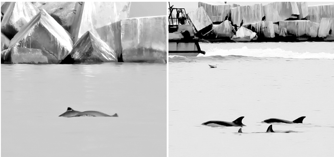
Fig. 2. Groups of harbour porpoises (female with calf; on the left) and common dolphins (adults with calf; on the right) in the navigation channel of Yuzhny Sea Port, near Hryhorivka village.

The primary type of cetaceans' behaviour in the waters of the estuary was feeding. In some cases we managed to detect that the feeding behaviour of cetaceans was associated with movements of large aggregations of fish: big-scale sand smelt ( Atherina boyeri Risso, 1810), representatives of a small species of the Mulletts family ( Liza sp.), whiting ( Merlangius merlangus Linnaeus, 1758), garfish ( Belone belone euxini Günther, 1866), and others. All the peak numbers of common dolphins (groups of 20–25 individuals observed in August 2015) coincided with the observed big aggregations of small sized mullet species such as golden grey mullet ( Liza aurata Russo, 1810) and leaping mullet ( Mugil saliens Risso, 1810); the sand smelt was also present in the area. Likewise, reports of local fishermen showed that the large groups of dolphins are encountered in the estuary during the seasonal migrations of mullets to the sea and back.