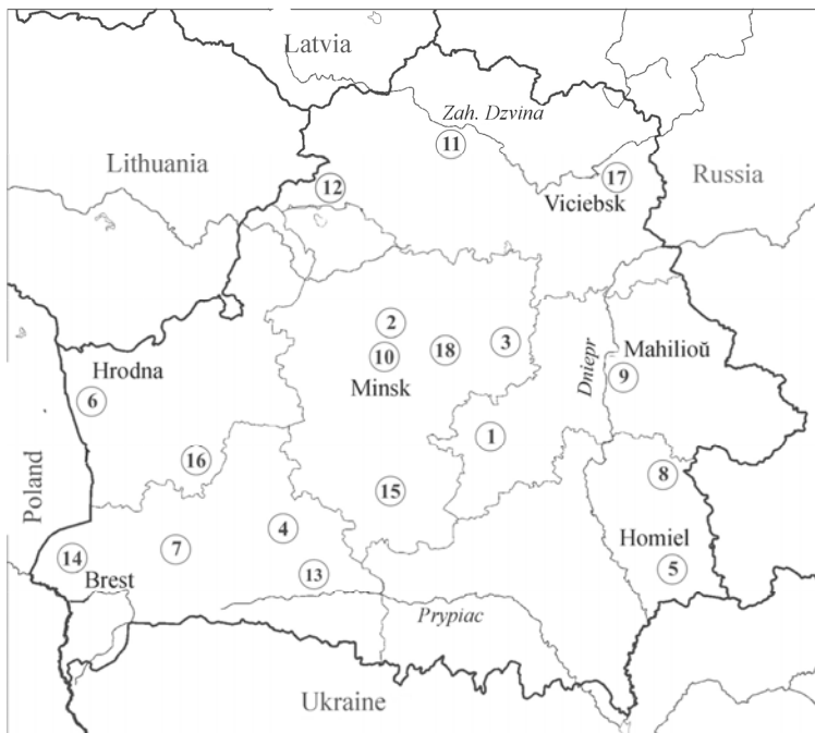
Fig. 2. Localities of finds of wintering bats in Belarus.

Рис. 2. Місцезнаходження зимуючих кажанів в Білорусі.