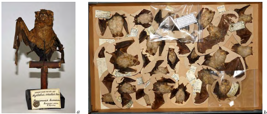
Fig. 2. Bats in the collection of ZMD: a — one of the oldest specimens of bats in the Museum, Nyctalus lasiopterus ; b — a box with study skins of bats as an example of their storing in the Museum.

In the monograph “The Mammals of Western Ukraine” (Tatarinov, 1956), at the end of the essay the author writes on the greater noctule bat the following: “Apparently, this kind of noctule bat in the western regions of the Ukrainian SSR is very rare, but in Dobrudja, according to verbal evidence that we have, it is [a] common [species]”. In our opinion, this is another confirmation that our specimen of the greater noctule bat comes from the territory of Romania, namely from Dobrudja, and therefore it was not discovered in western Ukraine.