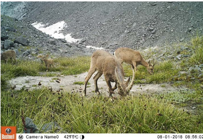
Fig. 4. Camera trap record of Siberian ibex next to the site where the kill was discovered in 2016.