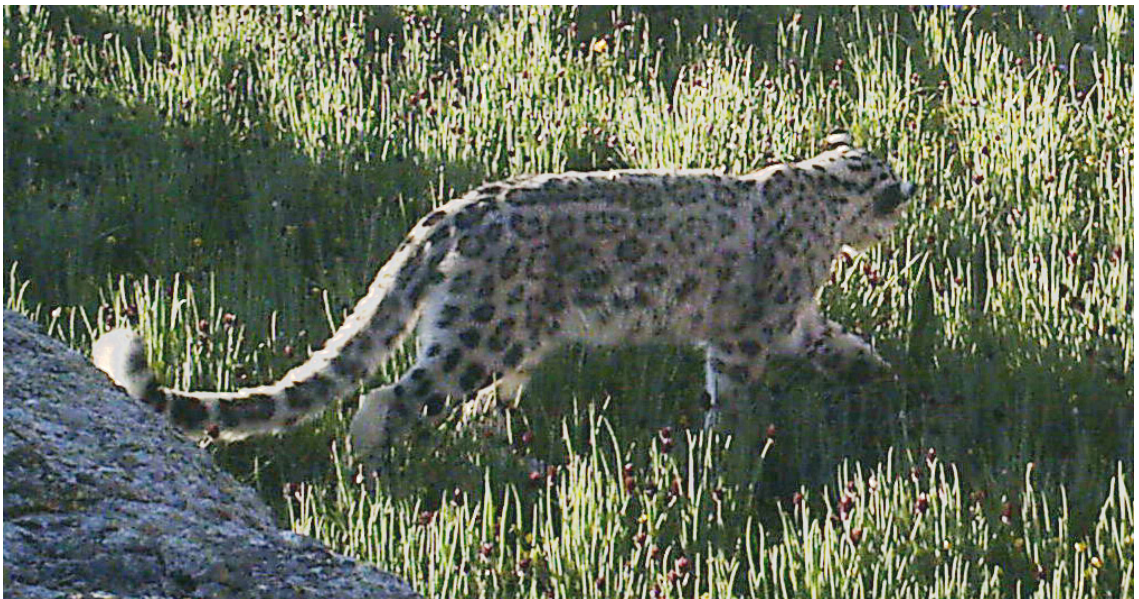
Fig. 6. Evening (zoomed) camera trap record of a snow leopard (15 th of July 2019, 19:50 PM), altitude 3512 m.

Рис. 5. Нічний знімок снігового барса, зроблений фотопасткою, висота 3720 м).