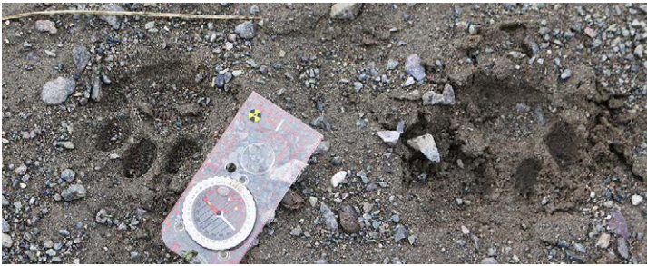
Fig. 2. Snow leopard pugmarks (11 th August 2016, altitude 3562 m).