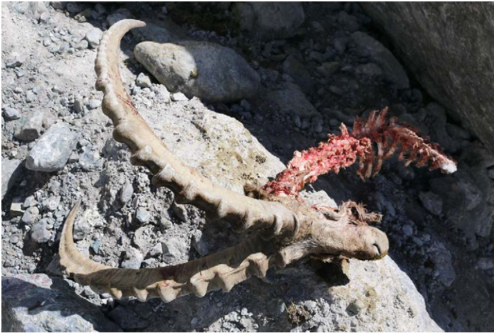
Fig. 3. Snow leopard kill of a Siberian ibex (25 th August 2016, altitude 3560 m).