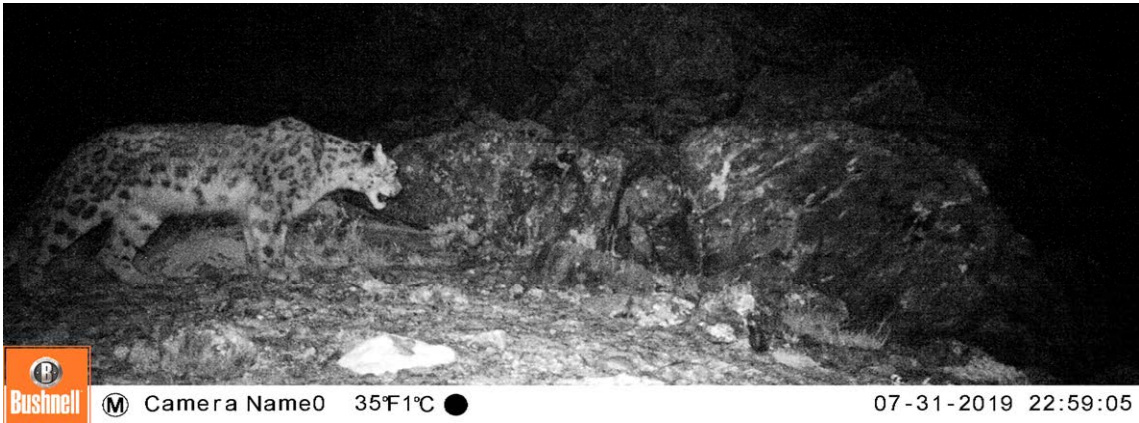
Fig. 5. Nighttime camera trap record of a snow leopard, altitude 3720 m.

Рис. 5. Нічний знімок снігового барса, зроблений фотопасткою, висота 3720 м).