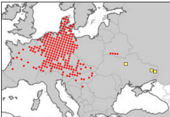
Fig. 2. Distribution range of the raccoon in Europe according to the review on web-resource DAISIE (Winter, 2009) and the location of the record described here from Kyiv and of the species' release in Luhansk region.

Threats of introductions and expansion. First, it is important to note that all of the studied cases of alien species impact on natural complexes are negative. This is a generally acknowledged fact. Secondly, it is important to remember that all countries where the raccoon expands its range programs to counteract were urgently adopted (Salgado, 2018; CABI, 2019). The species' particular niche (predatory arboreal mammal) practically does not overlap with that of other species (partly with the niche of the wildcat and pine marten), but its expressive polyphagia (Bartoszewicz, 2011) makes the raccoon much more competitive than all local predatory mammals. Particularly striking are the effects of its predation on "low" nesting and terrestrial nesting birds and their clutches, which numbers can fall by 10 % in 10 years (Schmidt 2003; Winter, 2009). Another possible threat is potential involvement in zoonoses (Winter, 2009, etc.). However, as our studies have shown, records in the Rabies Bulletin Europe database regarding Ukraine and submitted as "raccoon" should be interpreted as "raccoon dog" (!) (Zagorodniuk, Korobchenko, 2007), which is related to the above mentioned confusion in the vernacular names of these predators. Accordingly, reports on the "raccoon's" participation in zoonoses refer to the "raccoon-like dog", i.e. Nyctereutes procyonoides .