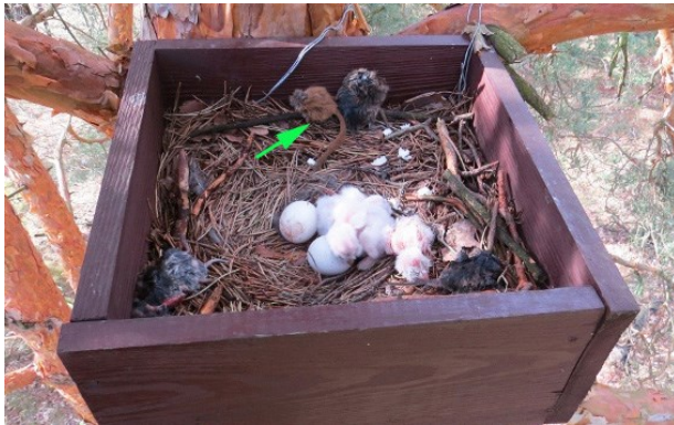
Fig. 3. Remains of the hazel dormouse at an artificial nest, Maloryta town (point 4).

Рис. 3. Рештки M. avellanarius в штучному гнізді, м. Малорита (точка 4).