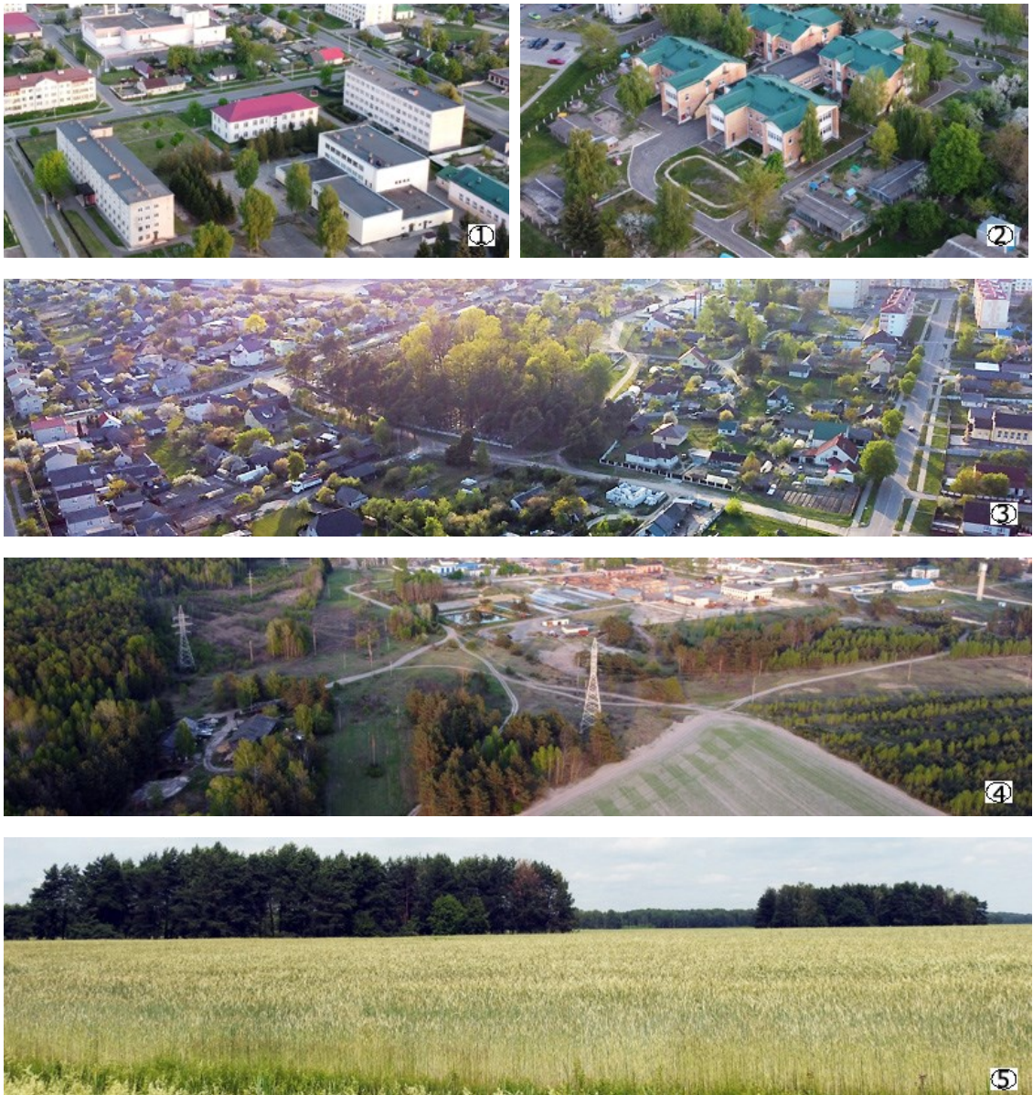
Fig. 2. General view of the area where pellets were collected (symbols are in the text).

Pellets were collected at five points. Points 1–4 are located in the town of Malaryta and point 5 is located in the Malarytsky district (Fig. 1 and 2): 1 — at the agricultural lyceum (N 51.791744° E 24.078101°), 2 — at the kindergarten "Solnyshko" (N 51.790512° E 24.084565°), 3 — in the old city cemetery (N 51.785991° E 24.079803°), 4 — on the outskirts of the city, by the water tower (N 51.783357° E 24.049449°), 5 — in the island coniferous forest near Lozitsa village (N 51.725889° E 23.995406°) located on a crop field.