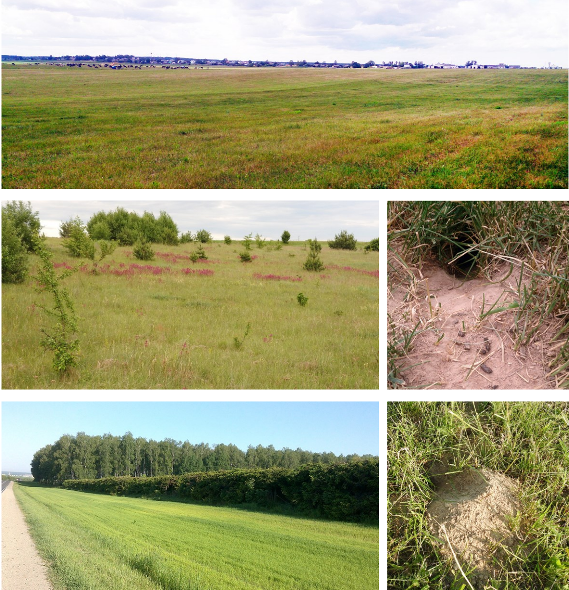
Fig. 2. Examples of ground squirrel habitats—biotopes and burrows: a ) site of the largest ground squirrel colony in Belarus in the vicinity of the village Yushevichi, June 2019; b ) overgrowth of woody-shrubby vegetation in the territory of the ground squirrel settlement near the urban settlement Mir, June 2017; c-e ) residential ground squirrel burrows, a colonial settlement in the vicinity of Rimashi, June 2019; d ) the ploughed and sowed area of the ground squirrel colonial settlement near the village Ralyevo (Korelichy Raion), June 2017.

Given the variety of viewpoints on the taxonomy of the speckled ground squirrel, including the recognition of western races (inhabiting west of the Dnieper River) as a separate species (e.g. Zago-rodniuk & Fyadorchanka 1995), the authors follow the traditional view and refer to the studied pop-ulations as S. suslicus sensu lato: in articles devoted to ground squirrel of Belarus, they are referred to as Spermophilus suslicus (e.g. Shakun & Maksimenkau 2013; Shakala 2019).