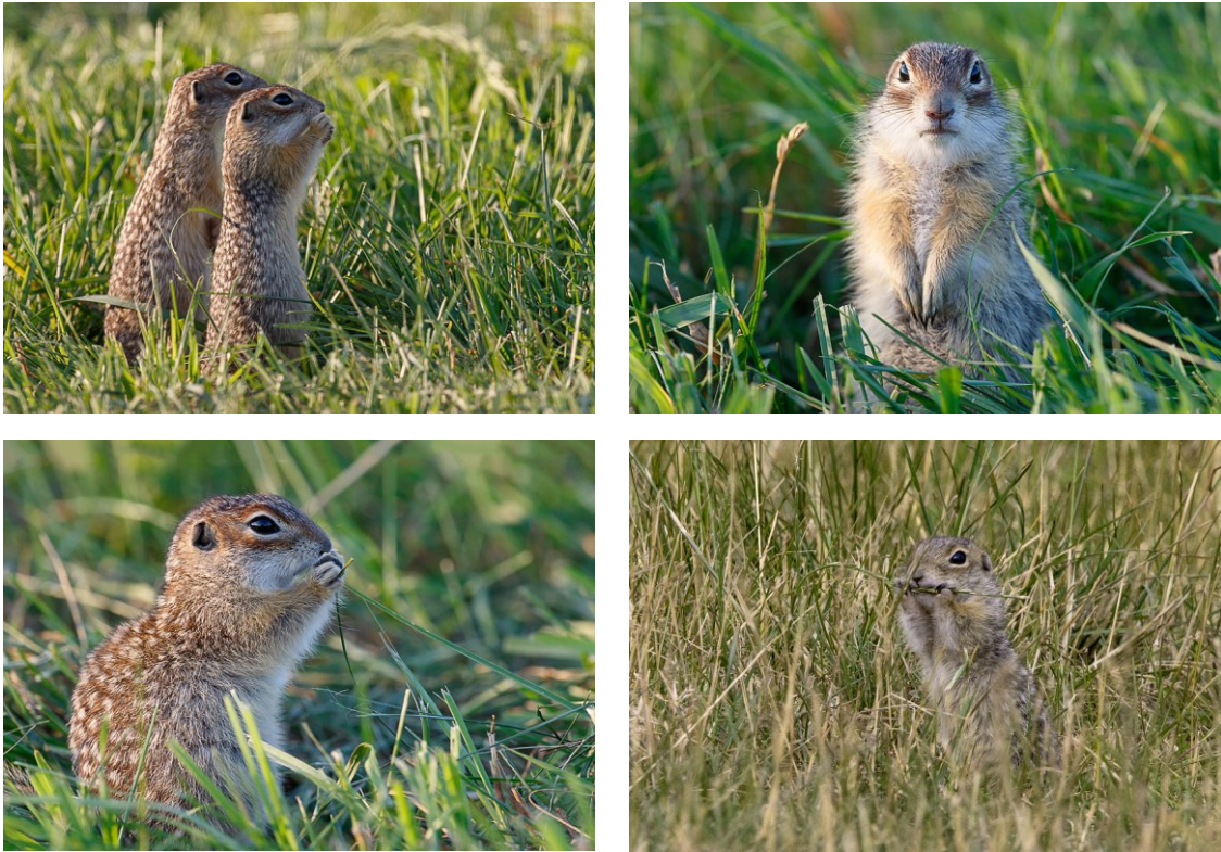
Fig. 1. Ground squirrels near their burrows, vicinity of Yushevichi, June 2019; a–c , photo by Pavel Lychkovsky; d , photo by the authors.

Рис. 1. Ховрахи біля своїх нір в окол. с. Юшевичі, червень 2019 р.: a–c , фото Павла Личковського; d , фото авторів.