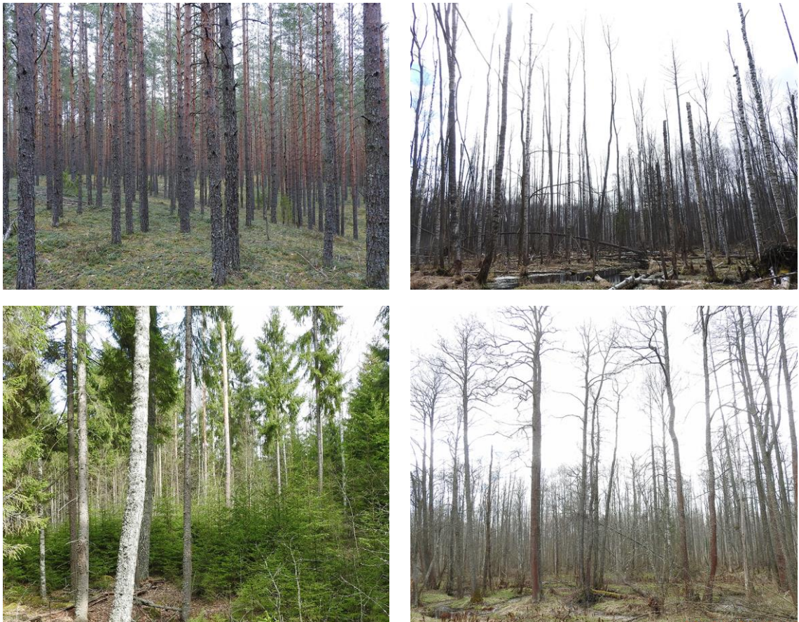
Fig. 3. Examples of biotopes where we have not recorded the species: a , pine monocultures, April 2017; b–d , thin deciduous forests (birch mires and black alder forests), Horodoksky and Vitebsk districts, April 2017; c , thin medium-aged coniferous forests, April 2017.

The southern border of the current distribution of the species in Belarus does not cross the Kaspla River and further (downstream from the mouth of the Kaspla River)—the Western Dźvina River. In the west, the border of the species' range can be tentatively drawn along the M8 (E95) motorway and along the eastern slopes of the Haradokskaja Upland. To the west of the M8 (E95) motorway, the species was found only in one place (vicinity of the village of Tryhubcy, Viciebsk region). However, the species is not recorded further west of Tryhubcy.