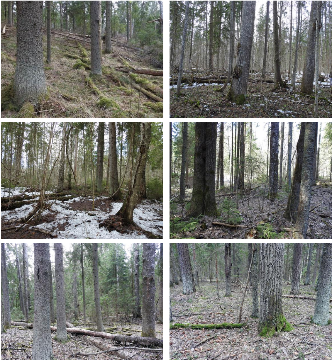
Fig. 2. Typical habitats of the Siberian flying squirrel in Belarus, Horodoksky and Vitebsk districts, March–April 2017–2020. Details: a , mossy spruce forest; b , goutweed aspen forest; c , wood sorrel birch forest; d–e , wood sorrel aspen forest; f , mossy pine forest.

Рис. 2. Типові місця існування політухи в Білорусі, березень–квітень, Городоцький та Вітебський райони, 2017–2020. Деталі: a , ялиник моховий (склад за породами — 6Я2Б2ОС); b , осичник яглицевий (склад за породами — 6ОС2Б2Я+КЛ); c , березняк квасеницевий (склад за породами — 6БЗОС1Я); d , осичник квасеницевий (склад за породами — 7ОС2Б1Я); e , осичник квасеницевий (склад за породами — 4ОС4Я2Б); f , сосняк моховий (склад за породами — 4С2Я2ОС2Б).