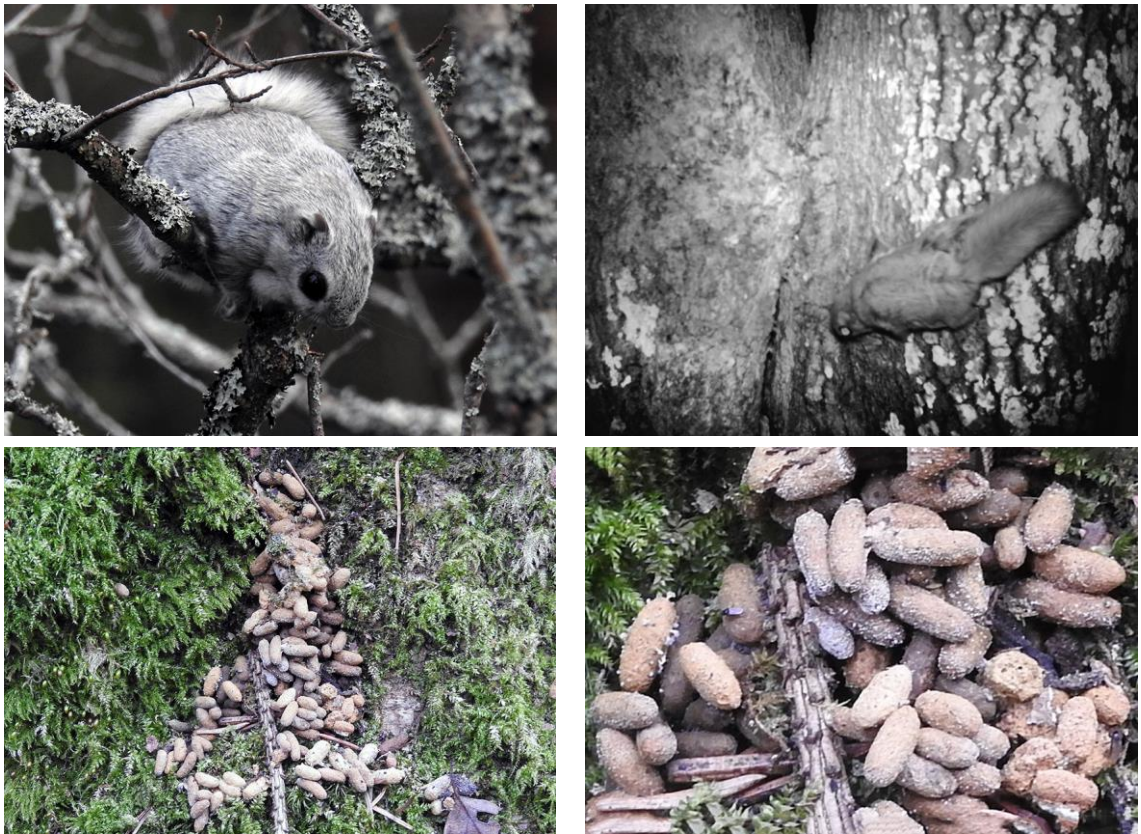
Fig. 1. The Siberian flying squirrel at the hollow (night photo), characteristic faeces of the flying squirrel, Horodoksky and Vitebsk districts, March–April 2018–2020; a–b , photo by Denis Kitel; c–d , photo by the author.

The pellets are searched for near the largest trees in the area (at least 30 cm), mainly aspen, but also birch, spruce, and alder. The best fieldwork period (under conditions of northern Belarus) is from late March, after the snow cover melts, to early May.