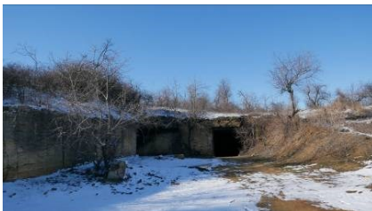
Fig. 3. One of the entrances and passages in mine KVL-K. Рис. 3. Один із входів і тунелів штольні KVL-K.