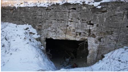
Fig. 2. One of the entrances and passages in mine ILN-K. Рис. 2. Один із входів і тунелів штольні ILN-K.