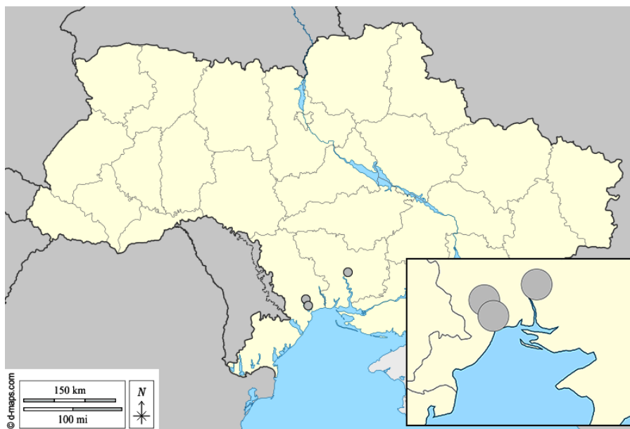
Fig. 1. Research region and location of key wintering sites.

The examined underground cavities are located within the continental part of the Black Sea region and in the steppe zone of Ukraine (Fig. 1). All of the examined localities are underground limestone mines with a considerable total length of underground passages (5 to 30 km).