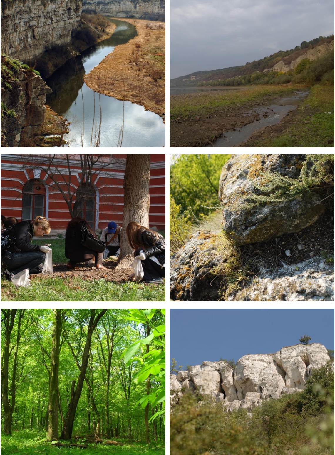
Fig. 2. The main collecting localities of pellets in Podillia, including the canyon-like valleys of the Dnister River, other rivers, caves, rocks, forest, urban environment; all photos by the author.

Рис. 2. Основні місця збору пелеток на Поділлі — каньйоноподібні долини Дністра, інші річки, гроти, скелі, ліс, міське середовище, усі фото автора.