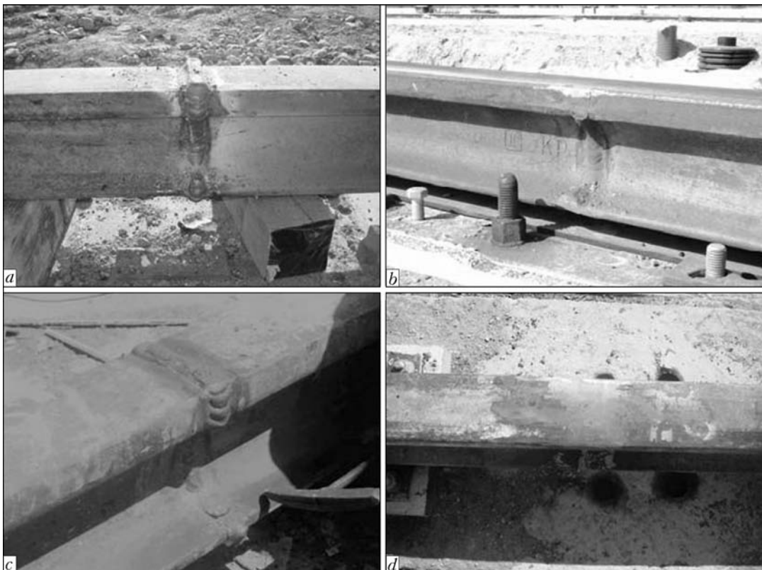
Figure 4. Crane rails KR100 ( a, b ) and KR120 ( c, d ) after welding ( a, c ) and grinding ( b, d )

Developed special welding consumables and welding technology ensure rather high values of mechanical properties of welded joints. Hardness of metal of R65 rail welded joints is equal to HB 260–320; weld metal ultimate strength is 800–900 MPa. Breaking load at rail testing for static bending is 1500–1650 kN at bending of 16–22 mm.