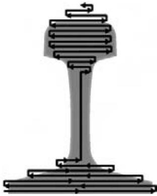
Figure 2. Schematics of nozzle displacement in arc welding of rails by bath method with a consumable nozzle

Figure 2) that ensures complete penetration of the edges being welded across the entire rail section. Foot welding is performed on a ceramic backing by multipass welding. After that a special lever mechanism is used to perform pressing down of copper shoes without interrupting the process, providing formation of weld side surfaces in welding of the rail web and head.