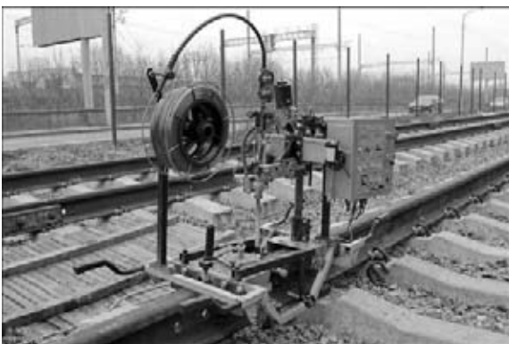
Figure 1. ARS-4 unit for rail welding

Welding is performed with a consumable nozzle, making reciprocal motions of varying amplitude (Fi-