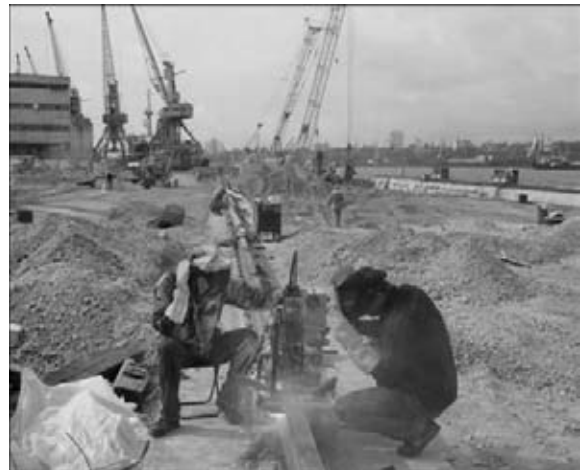
Figure 3. Welding crane tracks

Consumable-nozzle arc welding was earlier introduced in mounting of crane tracks of bulker terminal of Tuapse Commercial Sea Port (RF) (2009–2010) and Ilichevsk Sea Fishing Port (Ukraine) (2011)