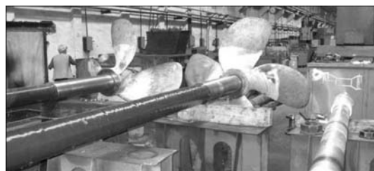
Figure 5. Propeller shaft as-assembled with screw

To obtain corrosion resistant layer the surfacing under the fluxes of grades AN-20 or AN-26 is applied using wire Sv-08Kh20N9G7T having high technological properties and providing high quality of deposited metal and, at their absence, the welding wires Sv-06Kh19N9T or Sv-04Kh19N11M3 are used. The thickness of corrosion-resistant deposited layer should be not less than 5.0–6.5 mm.