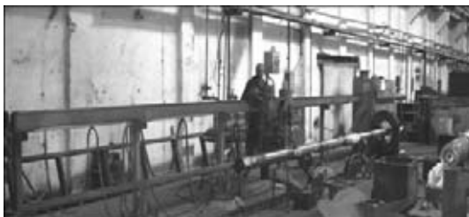
Figure 1. Hardfacing installation on the base of machine RM 461E

At the «Kherson Shipyard» to make hardfacing of propeller shafts of diameter up to 400 mm under flux the installation is applied, mounted on the base of the machine RM 461E for gas cutting of pipes with smooth control of speed of shaft rotation and dependent movement of electrode along the element of a shaft (Figure 1).