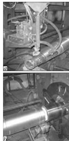
Figure 2. Hardfacing head of the installation (a) and shaft mounted in cartridge (b)

Propeller shafts with wear, corrosion fractures, cracks and collapses around the cone, under linings and in the rest part of a shaft, as well as corrosion cavities and other surface defects which can be the sources of fatigue cracks initiation are subjected to restoration surfacing. The shafts having such defects of depth of not more than 5 % in the limits of calculative (according to RMRS regulations) diameter of a shaft are admitted to restoration. During the wear exceeding 15 mm per side the restoration of shafts using surfacing is not admitted. The surface of a shaft subjected to surfacing should be machined until complete elimination of defects and should not have traces of dents, corrosion fractures, cracks, laminations, non-metallic inclusions.