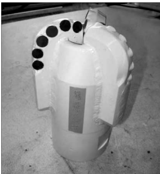
Figure 4. Appearance of bit blade with brazed-in DHC

It should be noted that brazing filler materials of Ag–Cu–Zn–Ni–Mn and Ag–Cu–Ni–Mn–Pd systems are suitable on their technological properties for brazing of DHC to bodies of drill bits. The experiments were carried out using generator VChI4-10U4 of 10 kW power. The following devices were developed and manufactured for DHC to blade brazing: