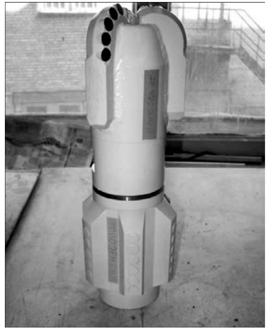
Figure 5. Drill bit with calibrator for on-land drilling of wells

3. It is determined based on results of performed commercial investigations of diamond