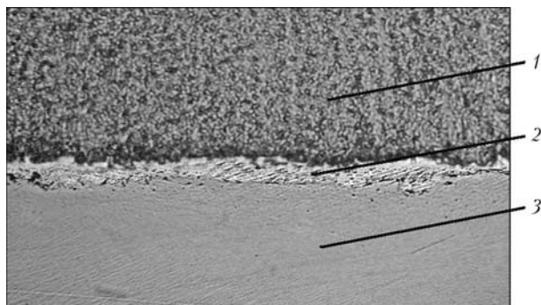
Figure 3. Microstructure ( \times 300 ) of brazed DHC + steel joint before drill bit testing: 1 – hard alloy VK8; 2 – brazed seam; 3 – steel 30Kh

ing of the latter to blade. Analysis of microstructure of brazed joint shows that brazing filler material of Ag–Cu–Zn–Ni–Mn system gives good wetting of hard alloy as well as steel, moreover fusion zone from both sides is smooth without formation of wide diffusion zones. Figure 3 shows microstructure of brazed DHC steel joint.