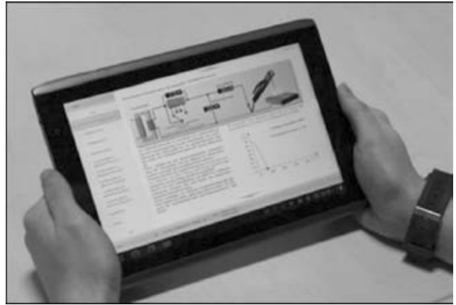
Figure 10. Modern tablet-PC as a terminal device for continuing education in welding technology