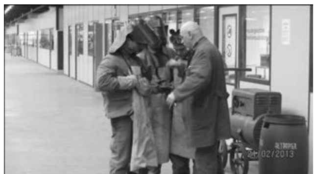
Figure 5. Expert assessment of results immediately after welding

Combination with metal-working. If one seeks to thoroughly develop the skills of young people in fundamental training, a complex study of metalworking with the emphasis on welding has proved itself over the years. A good example of this is the workshop of the GSI training centres (Rhein-Ruhr), which involves training in welding with the application of new VWTS methods combined with training in metal-working. A systems mechanic, who has been trained in this manner receives, after exposure to such a dual concept, a nationally-recognized skilled-worker cer-