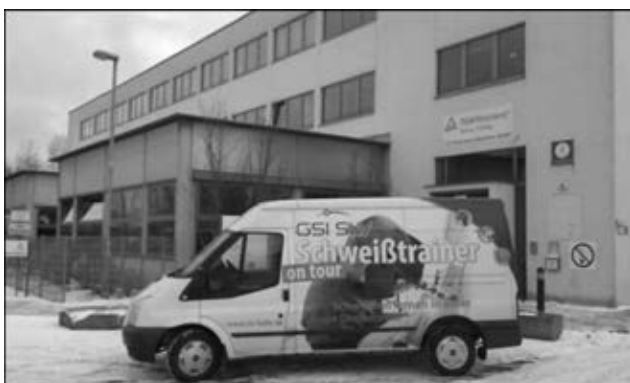
Figure 7. Mobile training station

Traning for welding engineers. Welding engineers are considered to be the central focal point for all questions regarding quality control in welding processes. Their technological qualifications, therefore, determine the quality of welded structures and products. This is why the qualification of expert welding engineers, within the context of welding-supervisor training, carries the highest priority.