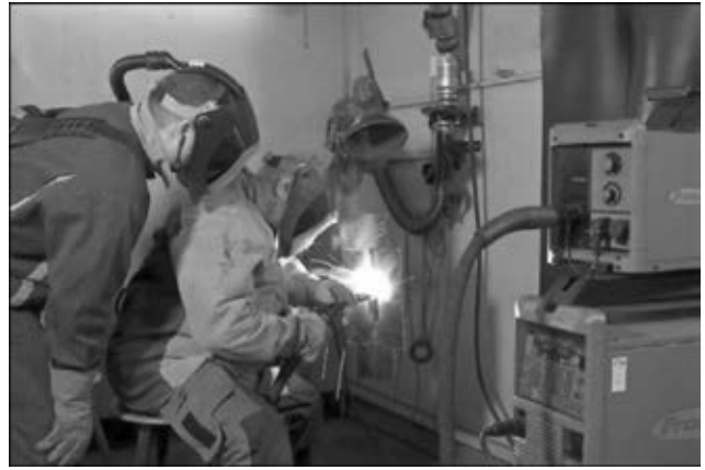
Figure 4. Welder during training in welding booth

Role of instructor. Computer-assisted methods in welding training with the benefit of VWTS enrich the educational process. They can complement, but not replace the traditional welding instructor. It is primarily human qualities and