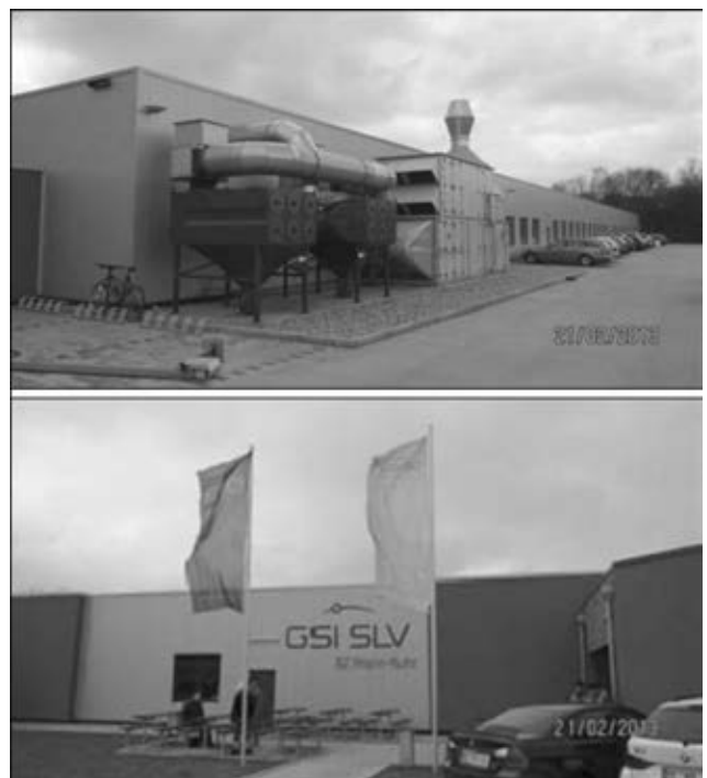
Figure 1. New development of the Bildungszentrum Rhein-Ruhr (BZRR) Gelsenkirchen-Schalke Site

Use of computers in direct relation to the training of professional welding personnel. In reference to practical welding training or training of machine operators, we have identified the fol-