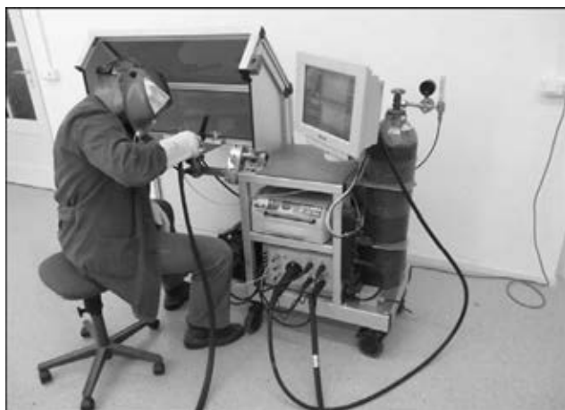
Figure 3. Semi-virtual VWTS with real low-capacity electric arc

More specifically, power sources are now capable of, regarding their regulation mechanisms, analyzing the welding process and adjusting to parameters. Particularly through the advent of pulse technology, the drop transfer is controlled,