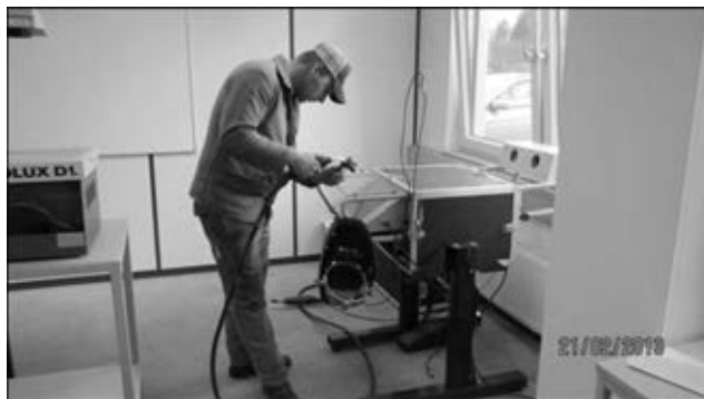
Figure 2. VWTS as a virtual system

lowing factors, whereby computers have changed the world of welding: