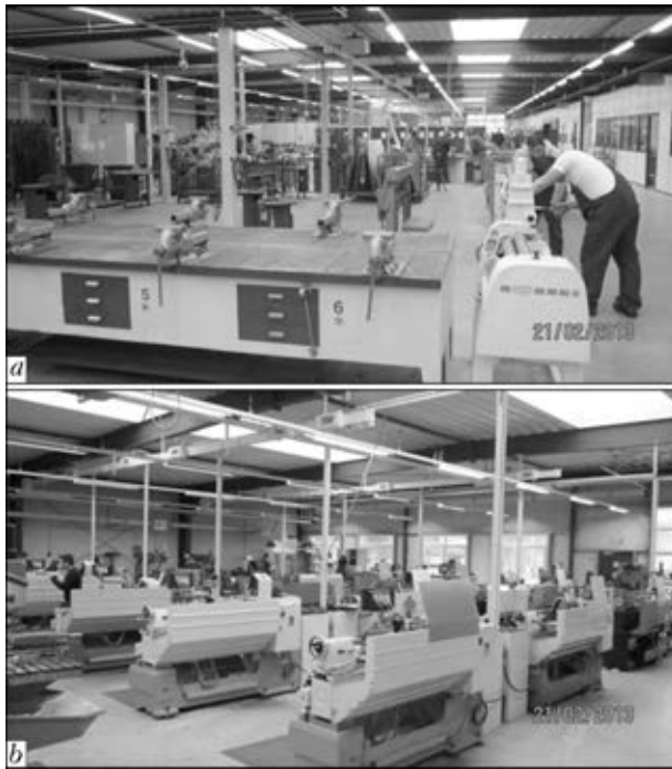
Figure 6. Training workshop of BZ RR (a), training facility of GSI and DVS (b)

tification. Figure 6 illustrate various stations within the training workshop.