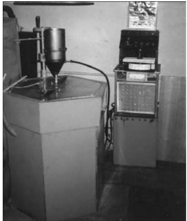
Figure 1. General view of stand OB-876Ts

In all the cases the deposition was performed on the plates of steel of St3 grade 20 mm thick.