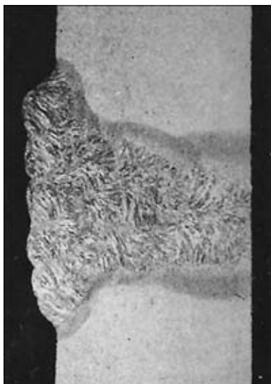
Figure 2. Macrosection of welded joint of a pipe produced using automatic CO 2 welding

At the initial stage the works on development of the technique and technology of welding were fulfilled. The basic tasks solved at this stage: to provide the high quality of a weld and strength of welded joint not lower than the strength of