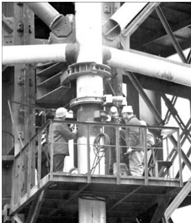
Figure 1. Removable erection platform for performance of automatic welding

This allowed applying the automatic welding during increment of the most critical elements of the tower (8 vertical columns of girth pipes of 550 mm diameter with the wall thickness of 18 and 22 mm), and thus realizing all the advantages of automatic welding both from the point of view of quality guaranteeing, as well as from the position of labor capacity.