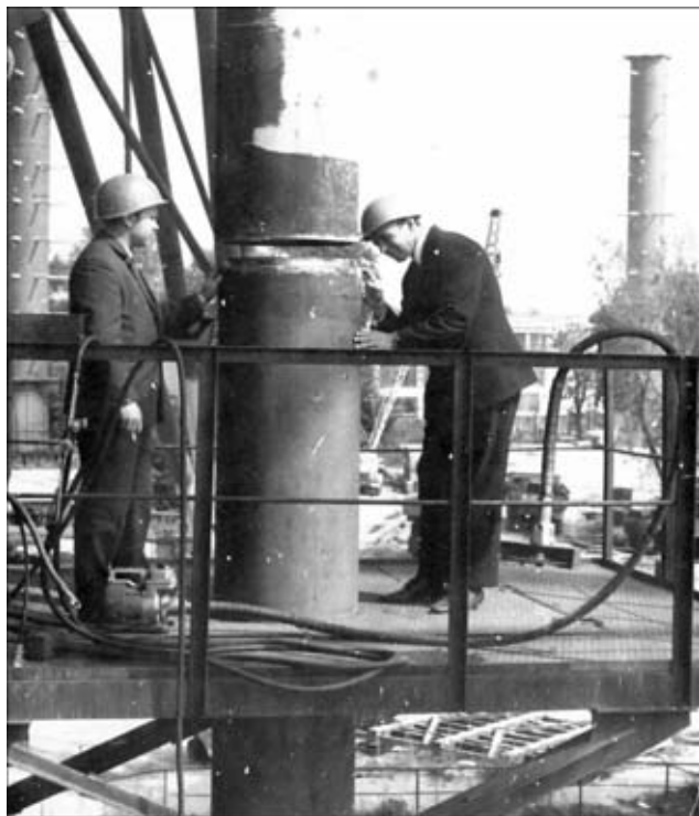
Figure 4. Quality control of assembly of circumferential butt

the erection site, and protective tent was installed.