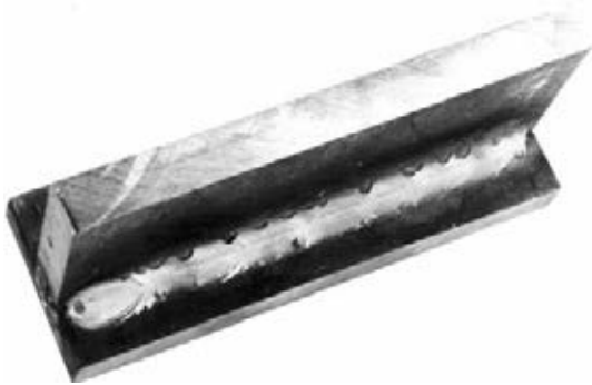
Figure 2. Appearance of fillet weld made in Ar + 20 % CO 2 mixture using Sv-08G2S wire of 1.2 mm diameter at I_w = 260 A and U_a = 28 V

Ar + O 2 + CO 2 mixtures have found wide distribution in Germany and Great Britain [9,