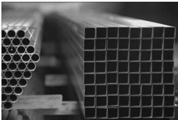
Figure 4. Kinds of standard export packing of square and round stainless steel tubes

In this work pitting corrosion (PC) studies in keeping with the main postulates of GOST 9.912 and ASTM G 48 were performed as experimental ones to obtain additional comparative data on corrosion resistance of welded tube material (base metal and weld zone of the same tube). Tube samples were soaked in aggressive 10 % solution (ferrous trichloride hexahydrate ( \text{FeCl}_3 \cdot 6\text{H}_2\text{O} )—100 g of salt per 900 cm 3 of distilled water) for 5 h at \approx 20 °C ( 19.5 \pm 0.5 °C). After soaking, the samples were washed, dried and their mass loss was assessed by weighing before and after soaking in an aggressive solution. Surface condition was also analyzed for presence, size, depth of pits and nature of their location, while paying special attention to the inner (working) surface. In keeping with the traditional concepts, it was confirmed that weld area is more prone to PC. In this case loss of mass of 0.004–0.008 g in samples with a weld is only slightly greater than loss of mass of 0.002–0.005 g in samples without a weld. However, in samples with rolled-off weld «r» mass loss of 0.006–0.008 g turned out to be greater than in samples with internal flash, i.e. without weld deformation «n» — 0.004 g. Moreover, samples with a rolled-off weld «r» demonstrated a greater sus-