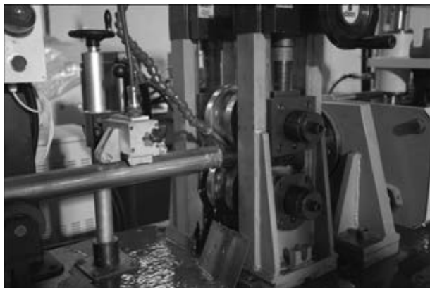
Figure 3. Eddy current flaw detector to monitor the continuity of weld and near-weld zone metal (located immediately after the welding assembly)

boiling in copper sulphate solution for 8 h. According to this standard, the welded joints, deposited metal and weld metal are not subjected to provoking heating. In this case testing was performed both without the preliminary provoking heating, and in a more stringent mode with provoking preheating — 650 °C for 1 h. After that, all the samples were bent by a special method to detect possible cracks. After testing no cracks were revealed in the places of Z-shaped sample bends, either on the inner or on the outer tube surface, or in the weld and near-weld zone, or in the base metal, that is indicative of ICC resistance of tubes produced by both variants.