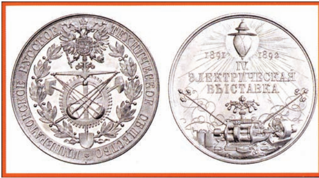
Gold medal of all-Russian Electrical Exhibition

N.N. Benardos worked continuously for the «electrofest» improving. At the IV All-Russian Electrical Exhibition, held in Saint-Petersburg in 1892, 30 different inventions of Benardos, formed into a separate exposition, was demonstrated. N.N. Benardos was awarded the highest award of the Exhibition: a gold medal.