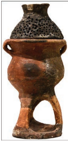
Ceramic muffle from Kvatskheli

ing from the lower sphere and is supplied warm into the chamber with burning coals. It is known that with the help of warm air the fuel heats up twice as fast and burns more economically and stably accumulates heat under the reflective lid. This creates excellent working conditions.