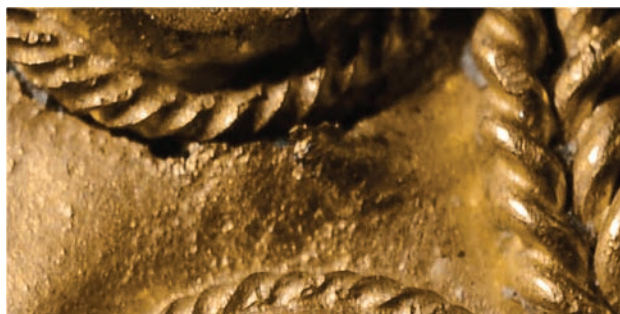
Traces of reaction brazing alloy on the artifact golden goblet from Trialeti

The conducted chemical analyses on the composition of the goblet show an increase in silver content in the places where substance brazing alloy had to be applied. We can make a bold assumption that this brazing alloy is made of gold with the addition of silver and copper, where silver prevails.