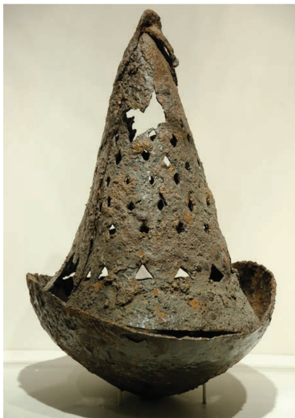
Artifact, muffle «Colchian cover»

After describing the application and content of the brazing alloy, Theophilus writes about the way a craftsman should do his brazing work. He points out on how a space in a bunch of burning coal can be created so that the product does not directly come in contact with fire, and a certain temperature would uniformly surround the parts to be joined. That is, as also Cellini later did, he is trying to create a muffle-like space in a bunch of burning coals. Although Theophilus is familiar with the method for manufacturing iron muffle for calcination of enamel and he even describes that method [3], he still offers another