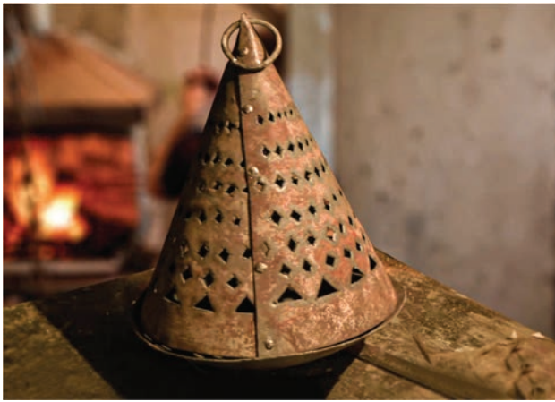
Copy of the muffle «Colchian cover»

millennium BC. This appliance consists of two parts made of hammered iron. The same as in the muffle described by P. Theophilus, it has a lower concave part and a tightly closed conical-shaped lid with a metal ring at the top.