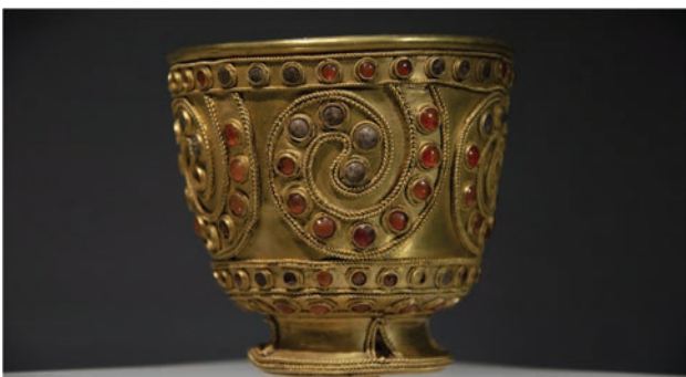
Artifact, «golden goblet from Trialeti»

Over the long years of work in this area, my attention was drawn to two products of refractory clay covered with holes, which are stored in the National Museum.