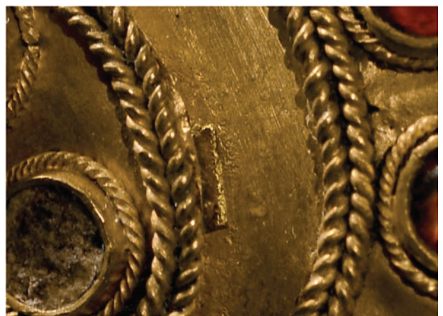
Unmelted fragments of substance brazing alloy on the artifact golden goblet from Trialeti

This indicates that some brazing alloy plates were prepared in an alloyed manner that did not melt during the first heating, and the craftsman was careful