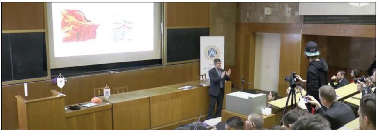
Figure 4. Yuri Gogotsi, world famous graduate of EPF of KPI. Dr. of Techn. Sci., Prof., founder of the Institute of Nanotechnology of Drexel University (Philadelphia, USA), nominee for the Nobel Prize in Physics in 2019, delivers an open lecture at the Igor Sikorsky KPI (2020)

newly founded structure is the ability to provide the full life cycle of materials, which combines their creation, production, joining, application and disposal. Such an approach allows E.O. Paton IMSW to carry out an expanded range of scientific and innovative projects and increase the contribution of Ukrainian science to modern world materials science.