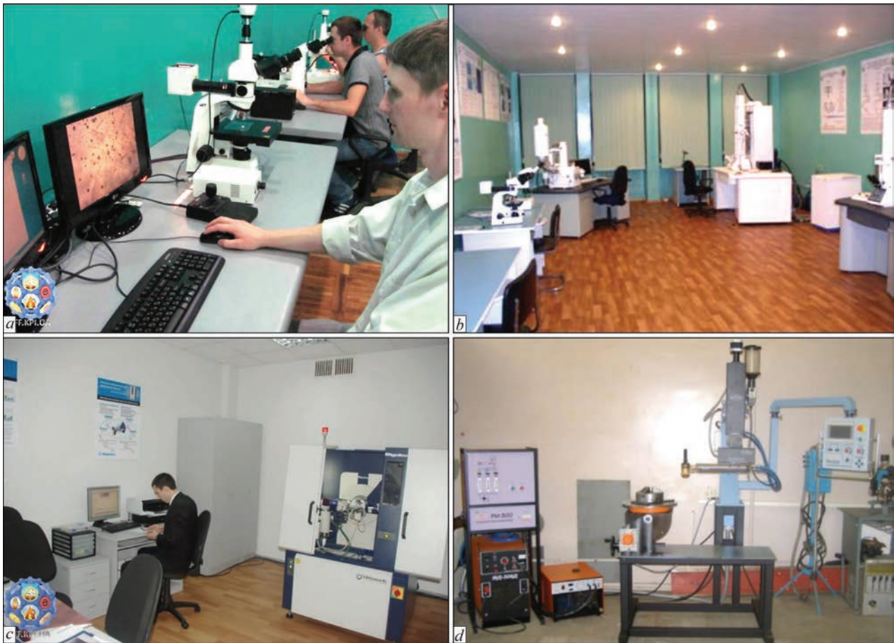
Figure 3. Students work in the Laboratory of Optical Microscopy (a); Laboratory of Electron Microscopy (b); conducting research in the Laboratory of X-ray Diffraction Analysis Rigaku (c); computerized installation PM-300 for plasma-powder surfacing in the Laboratory of Electron-Ion Technologies (d)

is aimed at the development of new materials and smart technologies for their joining on the basis of combining the potential of the leading scientific schools of the Igor Sikorsky KPI in the field of materials science, metallurgy, welding, surface engineering and laser technologies, as well as quality assurance of materials, products and structures. And the main advantage of the